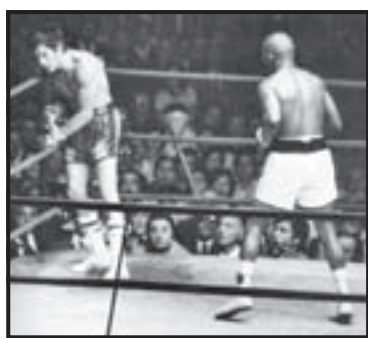
Monzon staggered by Briscoe

I had seen just about all of Hagler's fights going back to his amateur days and had never seen him rocked the way he was against Mugabi. The two traded monstrous punches