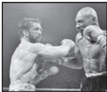
Antuofermo vs. Hagler

It was just short of a year after Hagler's war with Hearns and from the opening bell looked very much like it would be a repeat of that fight as Mugabi came out throwing bombs. There was one difference though, The Beast