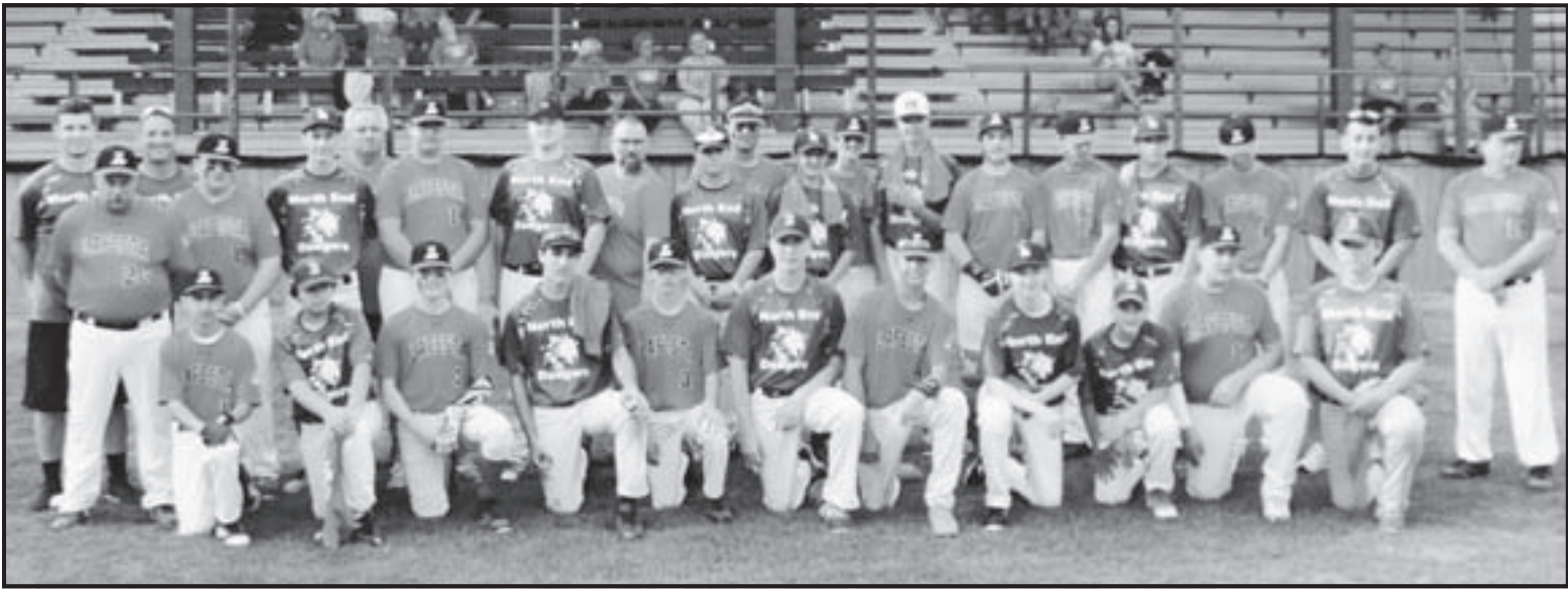
North End Dodgers and North Adams LaFesta All-stars