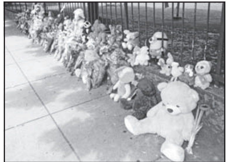
Toys, teddy bears and flowers line the fence near the corner of L and East Sixth Street as a reminder of a life lost, a smile gone, and innocence stolen.

As Flynn said, "That precious little boy should be skipping along down L Street today and every day until he turned the corner to manhood. But that