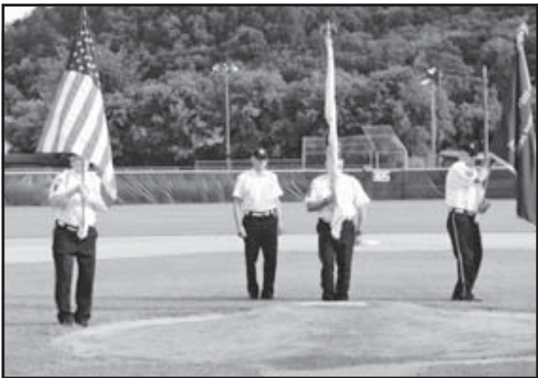
North Adams Color Guard