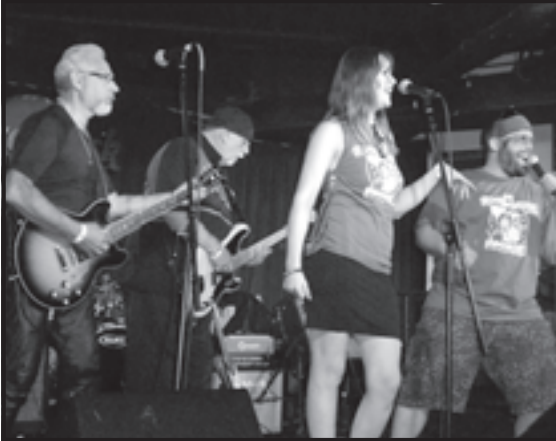
Beawolfe rocked the Hard Rock Café.