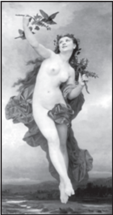
Primordial goddess of the day Hemera (1881). By William-Adolphe Bouguereau

Last week we discussed two of the most famous poets in ancient Greece, Homer and Hesiod. They were responsible for giving us more information on the folklore of mythical gods and legendary heroes than all other writers combined. We identified Chaos, the yawning abyss which marked the beginning of all things. Out of Chaos came the “Primary Beings” Nyx (Night); Erebus