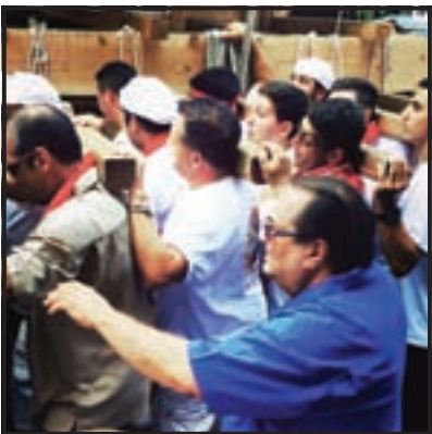
Members of Boston’s Saint Anthony Society participate in the lifting and dancing of the Giglio.

American tradition, the Feast of the Giglio (Lily) in honor of Saint Anthony of Padua. Over the past two years, the organizations have bonded by participating in each other’s festivals.