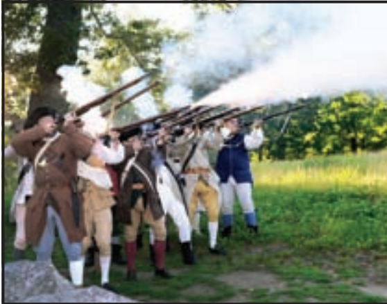
The Minute Men fire an ear-splitting volley, driving the Red Coats away and sending guests to dinner.