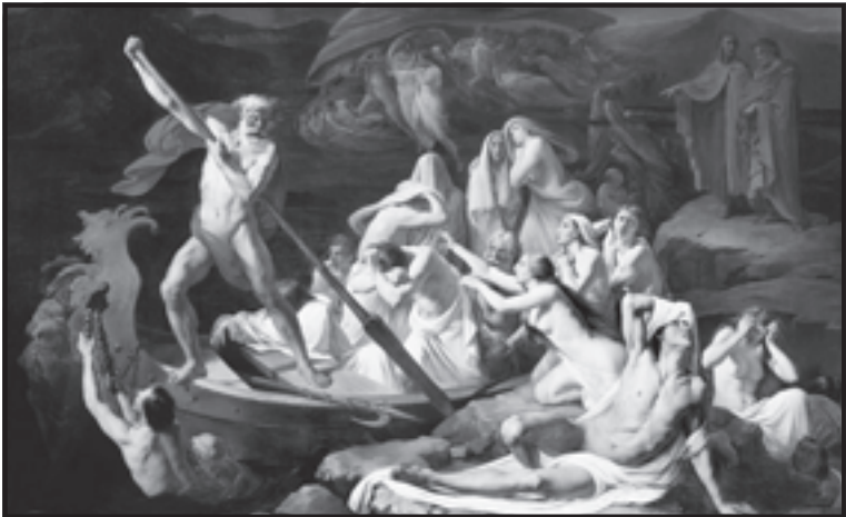
A 19 th -century interpretation of Charon's crossing.

Last week we discussed two of the most famous poets in ancient Greece, Homer and Hesiod. They were responsible for giving us more information on the folklore of mythical gods and legendary heroes than all other writers combined. We identified Chaos, the yawning abyss which marked the beginning of all things. Out of Chaos came the “Primary Beings” Nyx (Night); Erebus