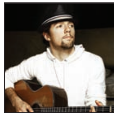
Musical sensation Jason Mraz will take the Wang Theatre stage on Friday, September 12 th and Saturday, September 13 th .

The Do-It-Yourself Stage at this year's festival would not be complete without the help from Kitchensurfing. Kitchensurfing is the marketplace community where