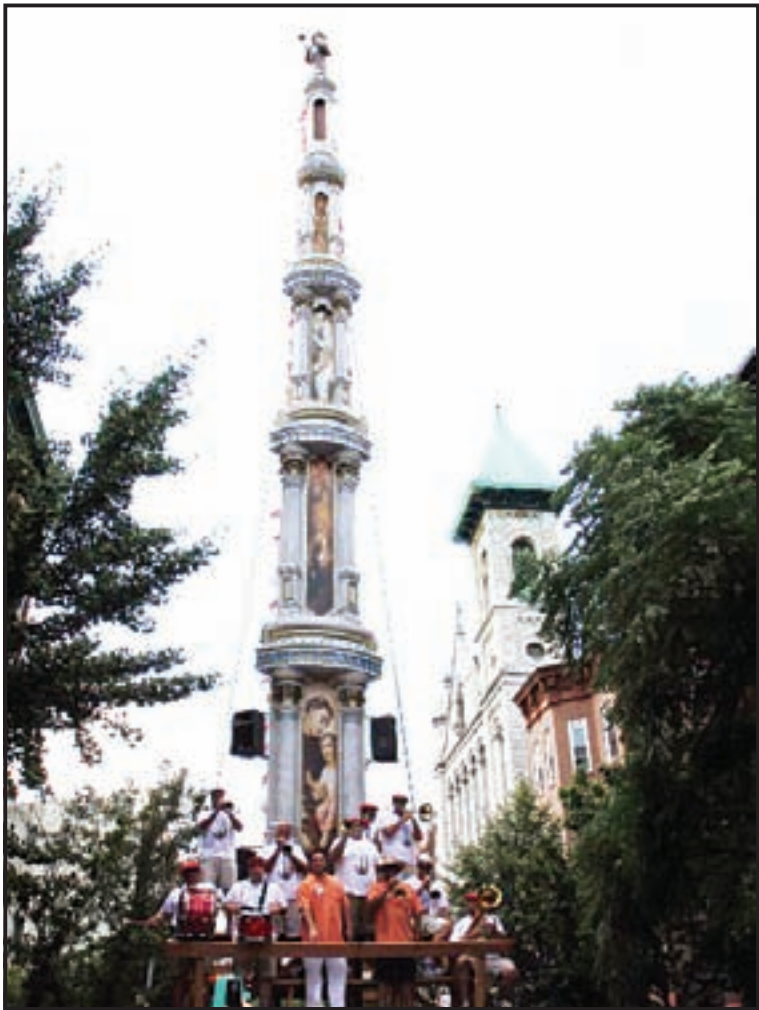
The Giglio Tower