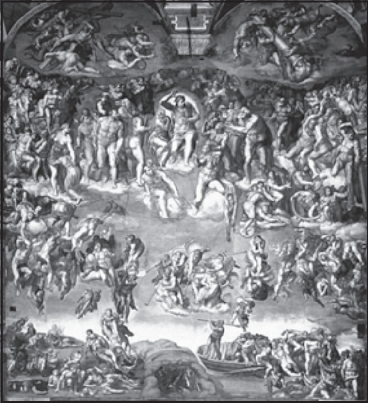
The Last Judgement by Michelangelo covers the wall behind the altar in the Sistine Chapel. The work depicts the second coming of Christ and, although the artist is clearly inspired by the Bible, it is his own imaginative vision that prevails in this painting.