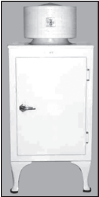
General Electric “Monitor-Top” refrigerator, introduced in 1927.

Recycling refrigerators and freezers creates many benefits for participating customers, the environment and community as a whole. Customers can save as much as $150 a year by having an older refrigerator or freezer hauled away. Old refrigerators contain more than 188 pounds of materials such as foam, glass, and metal that can be used in new products. Additionally, recycling just one refrigerator prevents up to 10 tons of carbon dioxide from entering the atmosphere, the equivalent of taking two cars off the road for an entire year.