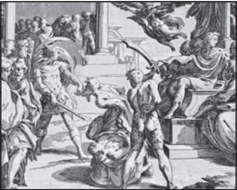
“The Martyrdom of St. Peter and St. Paul” c.1527-28, Cremona, Antonio da; (Italian; c. 1508-after1550) After Parmigianino, Francesco Mazzola; (Italian; 1503-1540)

Some astrologers predicted a long reign for Nero and some even described the return of all of his former fortunes. These dreams were soon shattered by the news of uprisings and revolts in the provinces. He immediately formed many wicked plans of monstrous proportions. He planned to degrade and assassinate the commanders of the armies along with the governors of all of the provinces; to massacre all exiles as well as all men of Gallic birth then in the city of Rome; to direct the armies to ravage the provinces; to poison the entire Senate at banquets; and then, as a “piece de resistance,” he planned to release all of the wild beasts that were held in captivity so that they could roam the streets while he set fire to the city. Needless to say, these plans did not make him the prime candidate for the “Man of the Year” award.