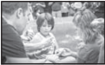
Lighting the candles for National Night Out