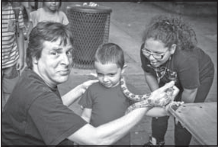
Snakes and turtles!