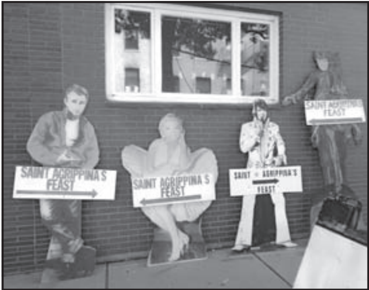
During this past weekend's Sant'Agrippina Feast procession, all roads got you to St. Agrippina's. Just look at these famous folks hanging around the Society Club pointing in the right direction, every which way but here.