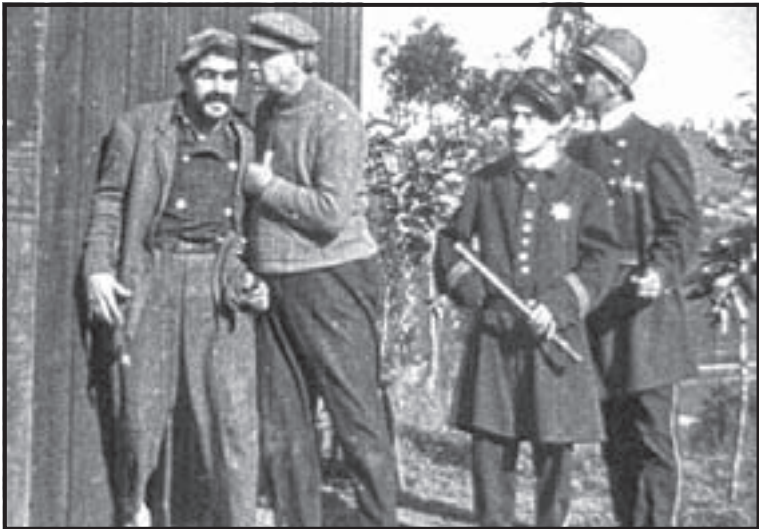
Chaplin’s cameo in A Thief Catcher

Considering the instability of early film and the amount of treasures that have been lost, we are fortunate that the bulk of Charlie Chaplin’s work has been safely preserved. Oh, there were some close calls. Two of his earliest films from his years at Keystone Studio were once thought lost but have since resurfaced. Both were atypical roles for Chaplin. Playing variants of his evolving Little Tramp character was not infrequent for Chaplin during his Keystone years, in part because studio boss Mack Sennett had other visions for comedy and in part because Chaplin himself was still evolving as an artist.