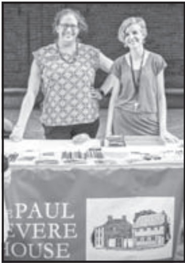
Employees of the Paul Revere House