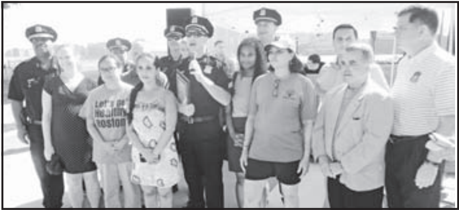
The East Boston Community Soup Kitchen receives a Community Service Award.