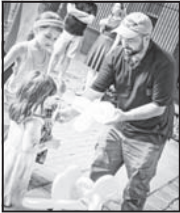
Balloon guy on the Prado