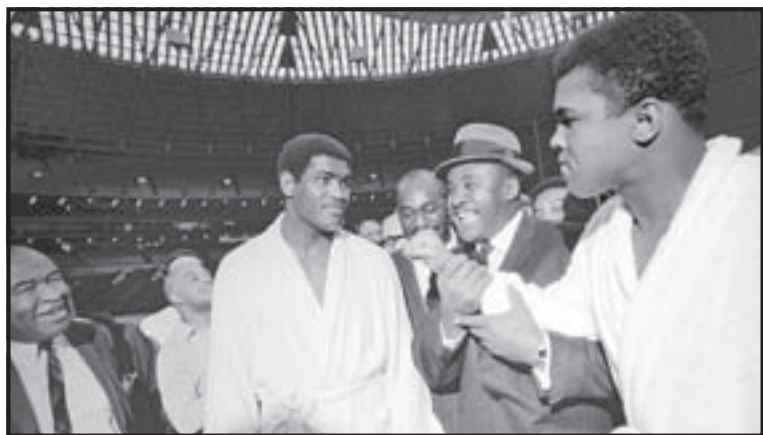
Terrell, Liston, and Ali in 1967

When the up and coming heavyweight contender Cassius Clay was campaigning for shot at champion Sonny Liston, it seemed as if he was always showing up in places where Sonny was. He once approached the Bear in a casino and started badgering him. Liston pulled out a gun and aimed it at Clay, who nearly had a heart attack. It turned out the gun was fake and Sonny got quite a kick out of putting a scare into the young upstart. Clay would also go "Bear Hunting," where he would appear at Liston's training camps carrying a bear trap. He would be ranting and raving about how he was going to "whup" the champion.