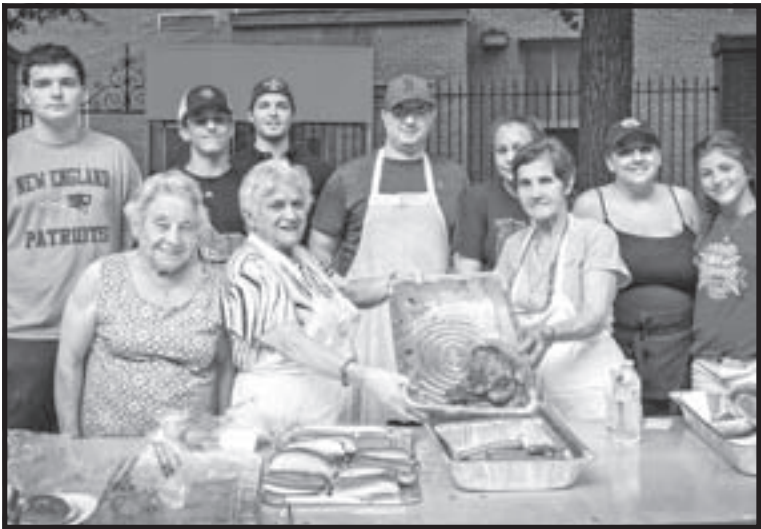
The workers at National Night Out