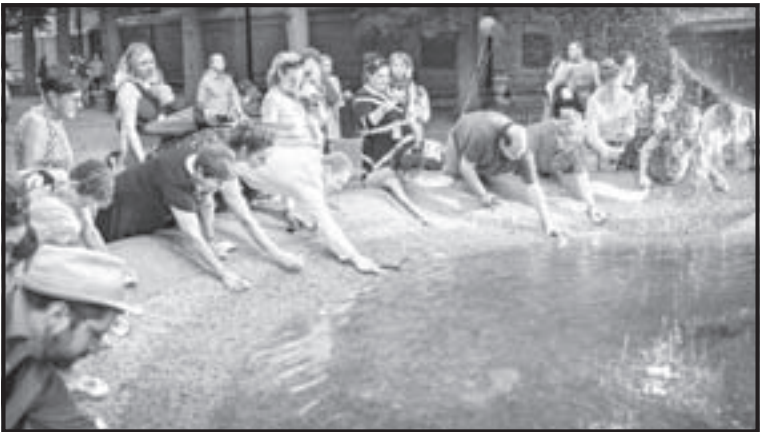
Floating candles in the Prado fountain at National Night Out

Many community groups and organizations set up tables in the Prado (Paul Revere Mall) for the party with free food and music by DJ Sal. A traditional candle-lighting ceremony capped off North End National Night Out at the Prado fountain.