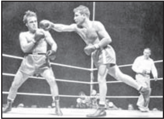
Cerdan vs. LaMotta

There are many other "what ifs" that would have us looking back at over a century of boxing that could have been very different. What if Joe Louis took that money his mother gave him for violin lessons and actually pursued an education in music instead of boxing? Would another heavyweight have dominated that era the way he did?