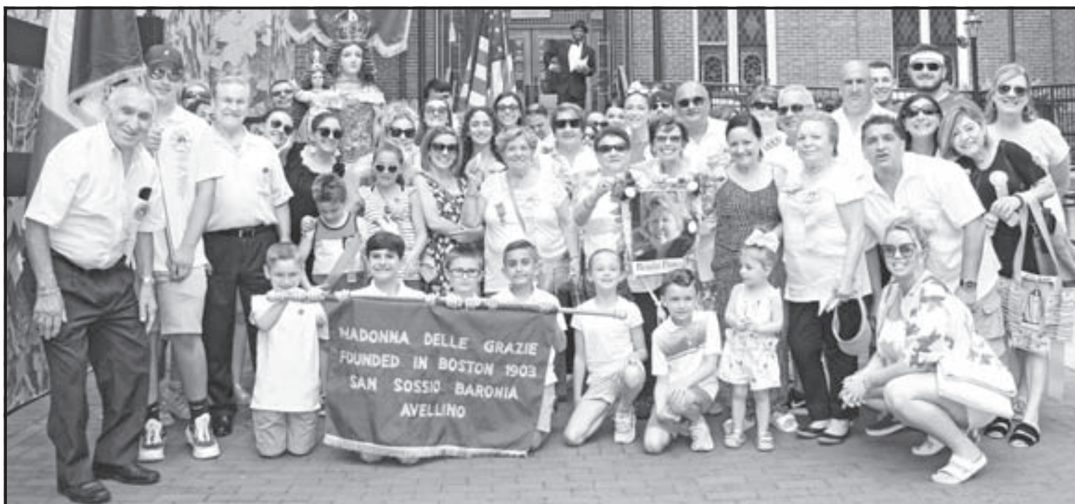
Madonna delle Grazie Society members

The first of the summer's many feast days celebrates Our Lady of Graces. In the North End the Society Madonna Delle Grazie of Avellino (founded in Boston in 1903) honors the Virgin Mary by carrying their statue of the youthful and smiling Saint in procession from St. Leonard's Church through nearby streets. For more than 100 years devotees have initiated the season of North End festivals by this act of devotion, this year on July 8 th . The curly-haired Saint receives charitable gifts in the form of dollar bills pinned to her glorious robes while graciously blessing all who pause to watch her sometimes stately progress along Hanover Street. Avellino is the name of both the town and the province on the plain surrounded by mountains in the Campania region of southern Italy, north-east of Naples. The Society was founded with the laudable purpose of welcoming, encouraging, assisting, and supporting Italian immigrants as they settled into their new lives and country.