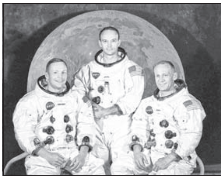
FIRST AMERICAN MEN TO WALK ON THE MOON. JULY 20, 1969 — The Apollo 11 lunar landing mission crew, pictured from left to right, Neil A. Armstrong, commander; Michael Collins, command module pilot; and Edwin E. Aldrin Jr., lunar module pilot.

My parents lived in Florida in 1964 and the first half of 1965. During the Project Gemini, I could watch the rockets go up from our backyard. In the 1960s, everyone watched rocket launchings on television. I remember portable TV sets in classrooms and in shops. We all were "Moon Struck." About the time we left Florida to move back North, the TV show I Dream of Jeannie came on the air. The male star was an astronaut who lived in Cocoa Beach. We were in neighboring Cocoa, Florida. That same year another space-themed TV launched, Lost in Space , followed the next year by Star Trek .