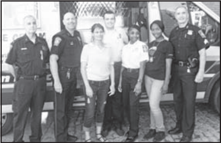
Thanks to the Boston Police Department for being ambassadors of peace and joy. A job well done by the guys and gals in blue.

Another great evening hosted by the Jeffries Point Neighborhood Association with a great assist by the Boston Police Department.