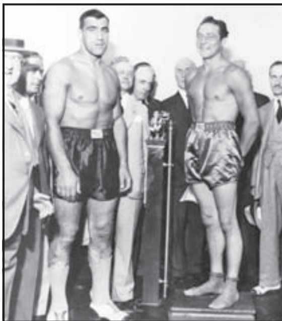
Carnera and Baer

What if Primo Carnera had not broken his ankle in the first round of his fight with Max Baer? Most people believe Carnera could never have beaten Baer, but even with a broken ankle he managed to last into the 11 th round against Baer, and even then he was still on his feet. What if he had two good feet for the duration of the fight? Baer was getting tired and Carnera certainly showed the