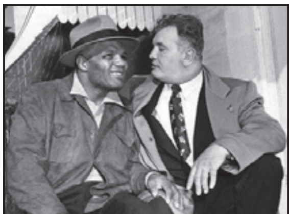
Jersey Joe Walcott and James Braddock