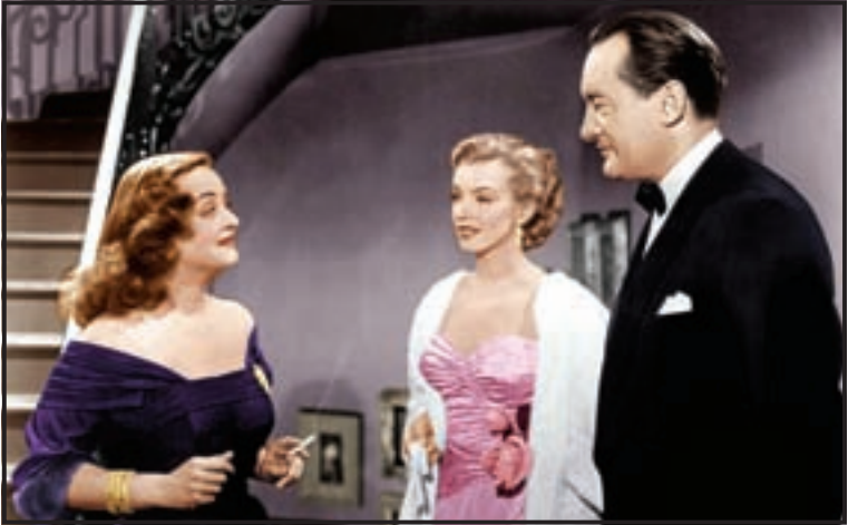
Don’t miss the Bette Davis Film Festival part of Boston’s FREE summer events that will be held Fridays at the Boston Public Library

Sunday is always packed with a lineup that appeals to any personal flavor of music and got going with local talent, “The Ballroom Thieves.” Directly after was the risky rock diva, “Halsey” and her signature turquoise colored hair. Plenty of entertaining acts kept the festival rolling through its final day and “TV on the Radio” got the crowd in the mood when they took the stage around 7:00 pm. By that time there was a sea of fans with every sort of style gathered in anticipation for the beloved comedian/actor, “Jack Black” and “Tenacious