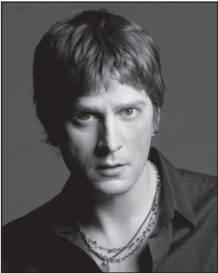
Grammy Award winner Rob Thomas of Matchbox Twenty fame makes a solo appearance at Blue Hills Pavilion. See MUSIC SECTION for further details.