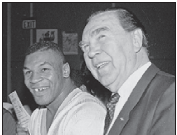
Mike Tyson with Max Schmeling