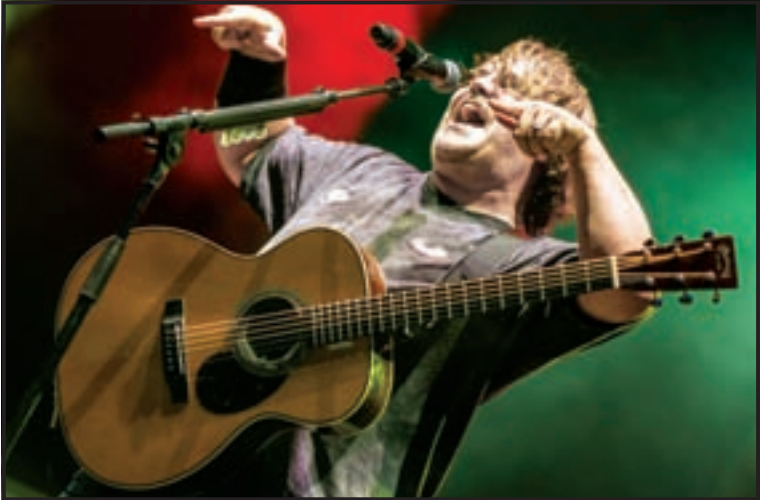
The fifth edition of the Boston Calling outdoor music festival was welcoming acts to the stage like “Jack Black” and “Tenacious D” to City Hall Plaza this past Memorial Day Weekend.

Socially Scene Reviewed ... This past Memorial Day weekend 44 Communications brought back the city’s newest staple running five festivals strong, Boston Calling.