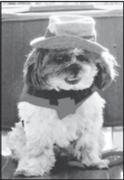
Here I am on the boat with a sun hat and life vest on. Thanks for caring Mom!