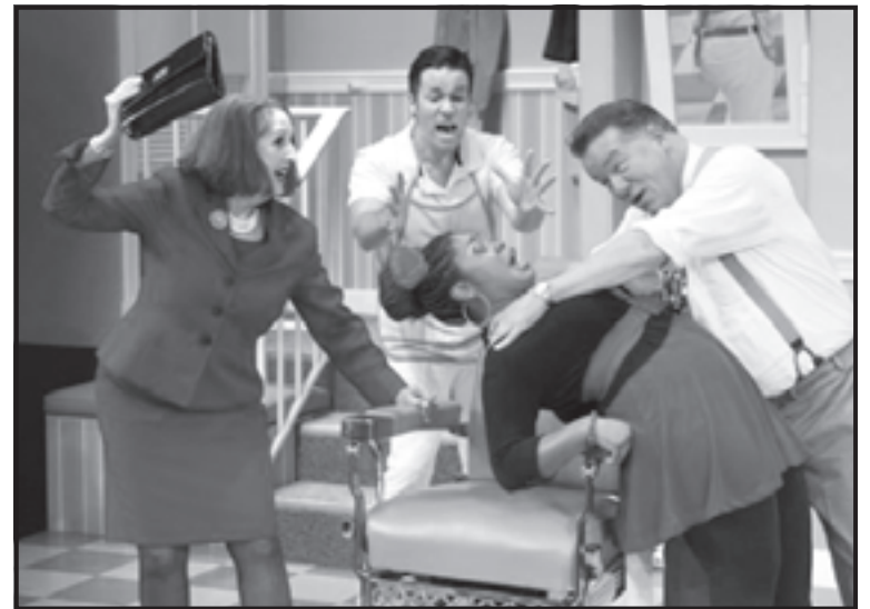
Hilarious and interactive mystery "Shear Madness" will be on The Charles River Playhouse stage through August 2nd.

work that is displayed by local creative minds makes the stroll around a scenic one.