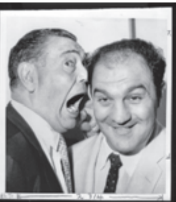
Jack Dempsey giving advice to Rocky Marciano.

This week I have put together a collection of photos of various champions hanging out together. A lot of these were publicity photos, but I know from experience that boxers have a bond that is stronger than that among athletes in any other sport. Prizefighters really enjoy