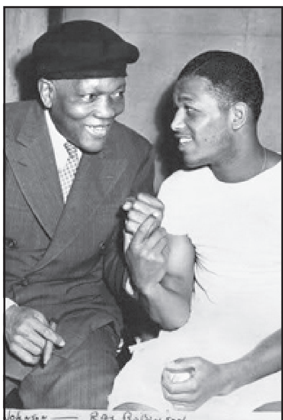
Jack Johnson with Sugar Ray Robinson