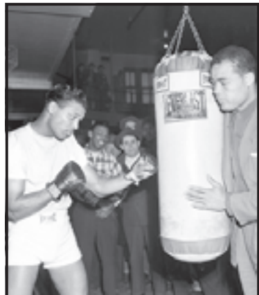
Joe Louis holds the bag for Sugar Ray Robinson.

Enjoy these photos, the guys in them seem to be enjoying themselves.