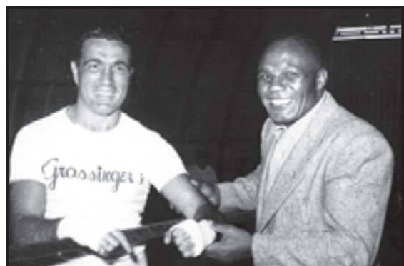
Joey Maxim and Jersey Joe Walcott