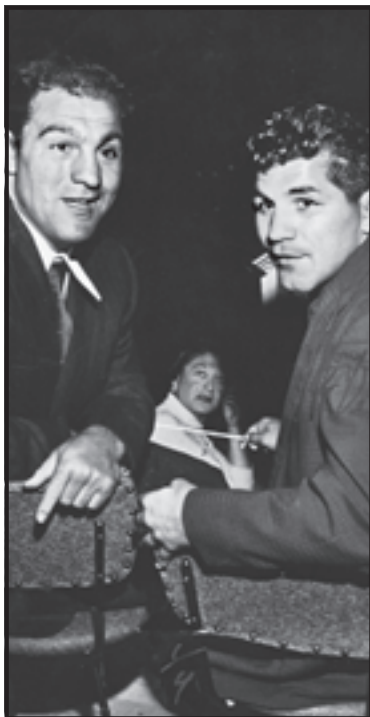
Rocky Marciano with Tony DeMarco