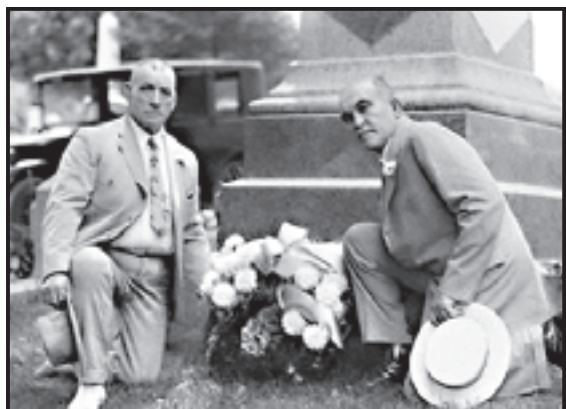
Tom Sharkey and James J. Jeffries at the grave of John L. Sullivan.