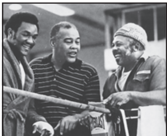
George Foreman, Joe Louis, and Archie Moore