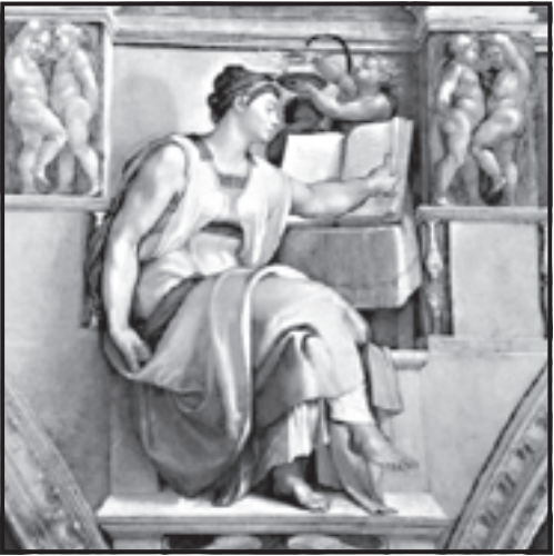
Michelangelo’s rendering of the Erythraean Sibyl.

Michelangelo’s Sistine Chapel ceiling fresco is said to be the world’s most powerful piece of painting. In addition to scenes which illustrate events from the Old Testament, he also enthroned seven prophets and five sibyls. The prophets are Jonah, Daniel, Isaiah, Zechariah, Joel, Ezekiel, and Jeremiah. The sibyls are Erythraea, who foretold the details of the passion of Christ and the Resurrection; Cumaea, who is credited with “God shall be born of a pure virgin and hold converse with sinners;” Delphica, or the Delphic Oracle, who, in addition to being consulted on national and personal matters, wrote many