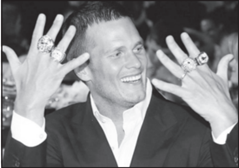
Quarterback Tom Brady shows off his four championship rings.

rings we present, we have tried to make each ceremony a little bigger and a little better than the one before," said a jubilant Robert Kraft. "Football is the consummate team sport. These championship rings represent all that the team endured and overcame together. The players on this team will forever be bound by the memories this ring represents. The presentation of the rings is one of my favorite moments. I love watching the expressions on the faces of each of our players and the range of emotions they experience when they see the ring for the first time and the pride they all have when they put it on. Tonight's celebration is really a culmination of a job well done."