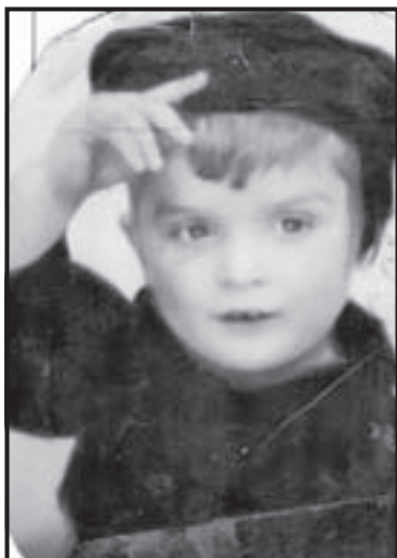
Here I am in my Scally cap back in 1953 at age 5.

Well, this Saturday, May 4 th I will turn 71 years old. I still walk the beach but no longer count the time. I walk as far and fast as possible and finishing it is success nowadays. I can’t believe it has been 16 years since I wrote the above note.