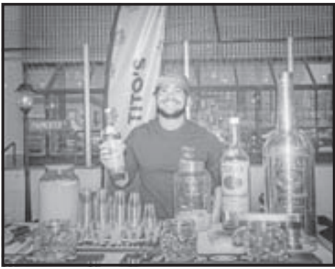
Tito's Handmade Vodka