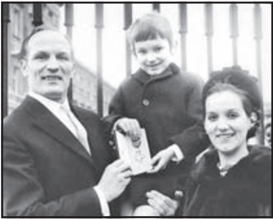
Henry with wife and son

He retired after losing the British title to Joe Bugner on a controversial decision. The British public never forgave Bugner for beating their beloved 'Enery. Cooper was knighted in 2000. He was appointed an Officer of the Order of the British Empire in 1969, and was granted a Papal Knighthood in 1978.