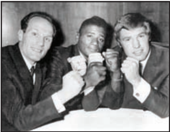
Henry, Floyd Patterson, and Billy Walker

Henry got a second shot at Clay, now Ali, in 1966 when he challenged the new champion for the title. Cooper gave a very good account of himself, but once again, he was plagued by fragile skin and was stopped on cuts again, this time in the sixth round.