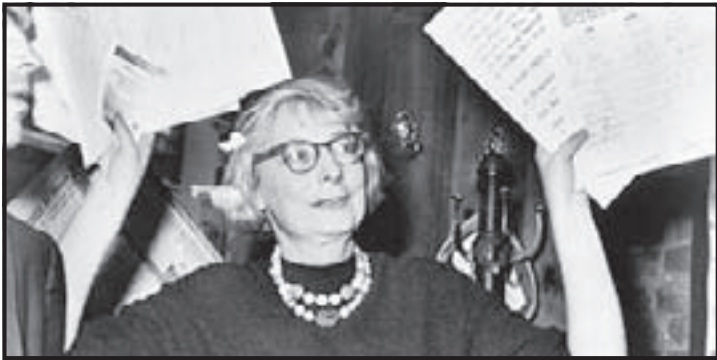
Jane Jacobs, public domain photo

Social Justice Advocate & Urban Renewal Opponent