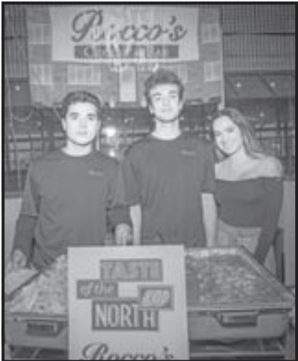
Rocco's Cucina & Bar