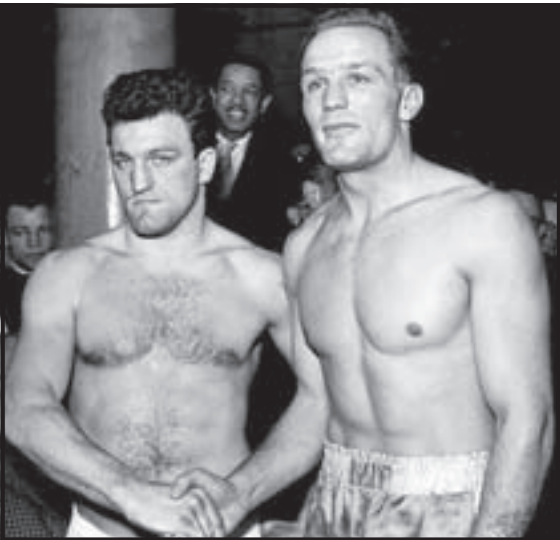
Brian London and Henry