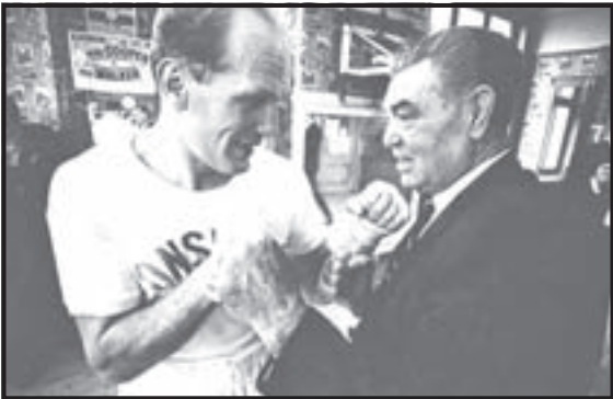
Cooper and Dempsey

Henry Cooper died on May 1, 2011 at the age of 76. Had he lived he would have turned 84 on May 3 rd . I'm sure he would smile to know fans are still lifting a pint in his memory and preferably doing it with their left hands to commemorate 'Enery's Hammer, his left hook.