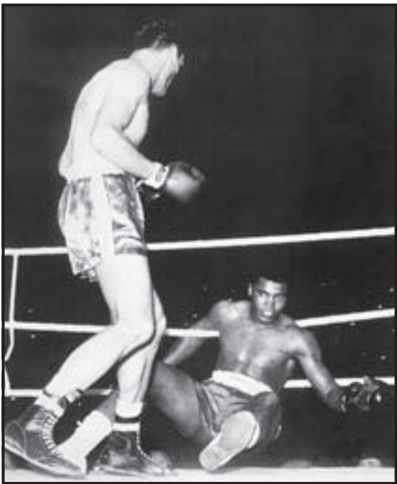
Henry decks Cassius Clay