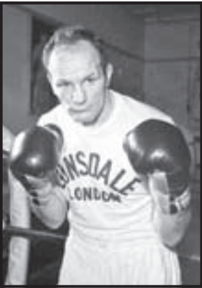
Henry in his prime

Henry Cooper was one of the most popular heavyweights fighting in the 1960s. He was not only wildly admired by his fellow Britons, he also had a huge following in the United States. In 1963, he fought an up and coming contender by the name of Cassius Clay. The fight took place in London, and in the 4 th , Henry landed one of the most famous left hooks ever thrown when his fist caught Clay flush on the jaw and dropped him. Clay staggered to his feet as the bell rang. Unfortunately, for Cooper, he was cut badly in the next round and the referee had no choice but to stop the fight.