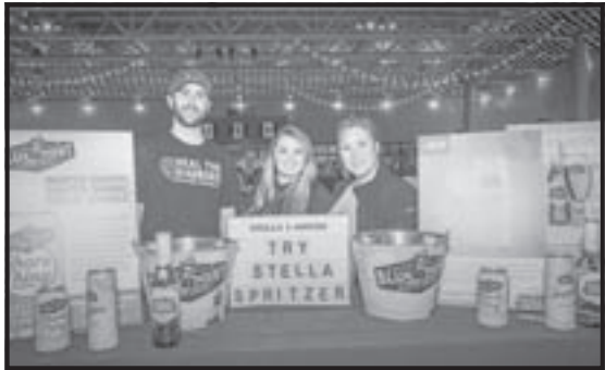
Busch - Stella Artois