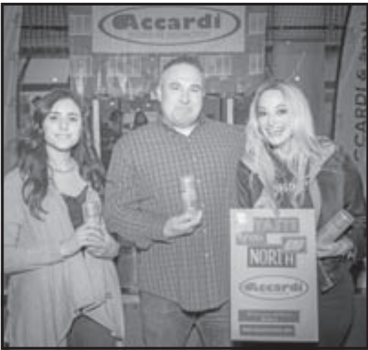
Accardi & Son