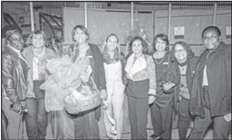
NEW Health and TONE organizers work the gift basket raffle