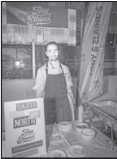
Tony and Elaine's