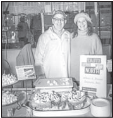
Albert A. Russo Imports