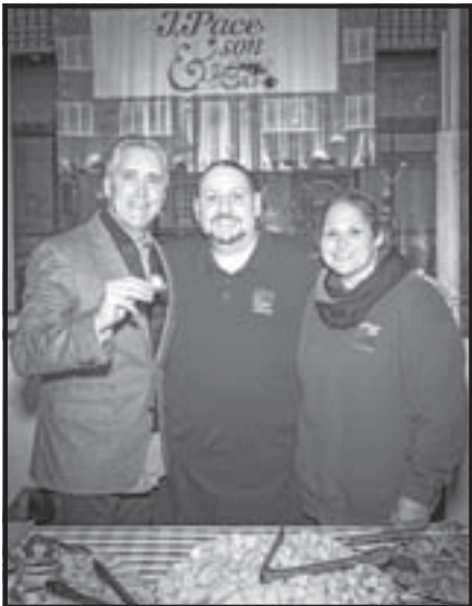
J. Pace & Son