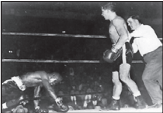
Tony DeMarco floors Johnny Saxton.