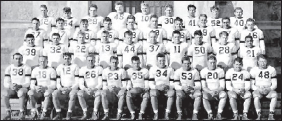
The 1940 Boston College Eagles