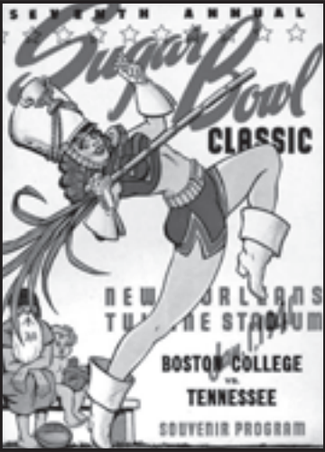
1941 Sugar Bowl Program