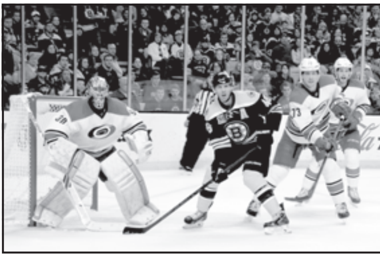
Boston Bruins vs. Carolina Hurricanes game on Saturday, March 15, 2014 at TD Garden. Bruins won 5-1.