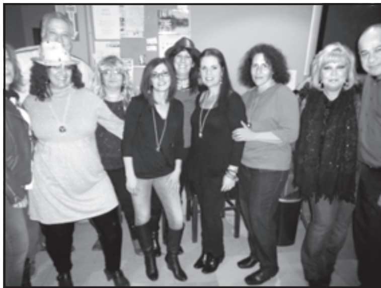
The East Boston High School Parents Council.