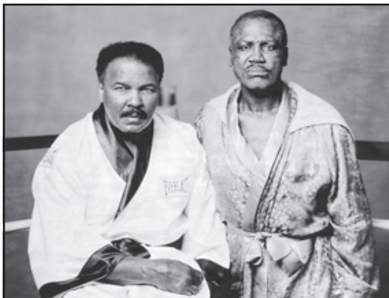
In the ring later in life.