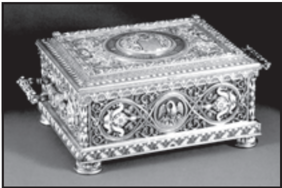
The Durnovo Casket (and detail), Silver gilt, enamel and lapis lazuli, 1889, Firm of Ovchinnikov, Russia.

Two Hundred Years of Russian Decorative Arts Under the Romanovs