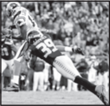
Brandon LaFell and Brandon Browner

On offense, the Patriots reached agreement with Julian Edelman meaning that Tom Brady's number one target from last season will return. This signing was huge. Edelman not only deserved the contract, but the offense needed the continuity. Along with bringing back Edelman, the team signed Carolina free agent wide receiver Brandon LaFell who has the size and speed to help the offense both in the slot and outside the numbers. Instead of relying on special teamer Matthew Slater (see AFC Championship game) LaFell gives Brady a legitimate downfield option, something that was lacking throughout the 2013 season. The team still needs to find a viable tight end as Rob Gronkowski may miss playing time as he continues to rehab his knee injury. A veteran lineman should be added to provide depth and fill the void at center, should the team not bring back Ryan Wendell.