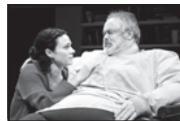
The Whale by Samuel D. Hunter has made its way to Boston and will be on the SpeakEasy stage through April 5 th .

Their program will feature; Mozart: Sonata for violin and piano in B-flat Major, K. 454, Bartok: Sonata No. 1 in C-sharp minor for violin and piano, Sz. 745 (BB 84) Opus 21, Webern: Four pieces for violin and piano, Opus 7 and Beethoven: Sonata No. 7 in C minor for violin and piano, Opus 30, no. 2.