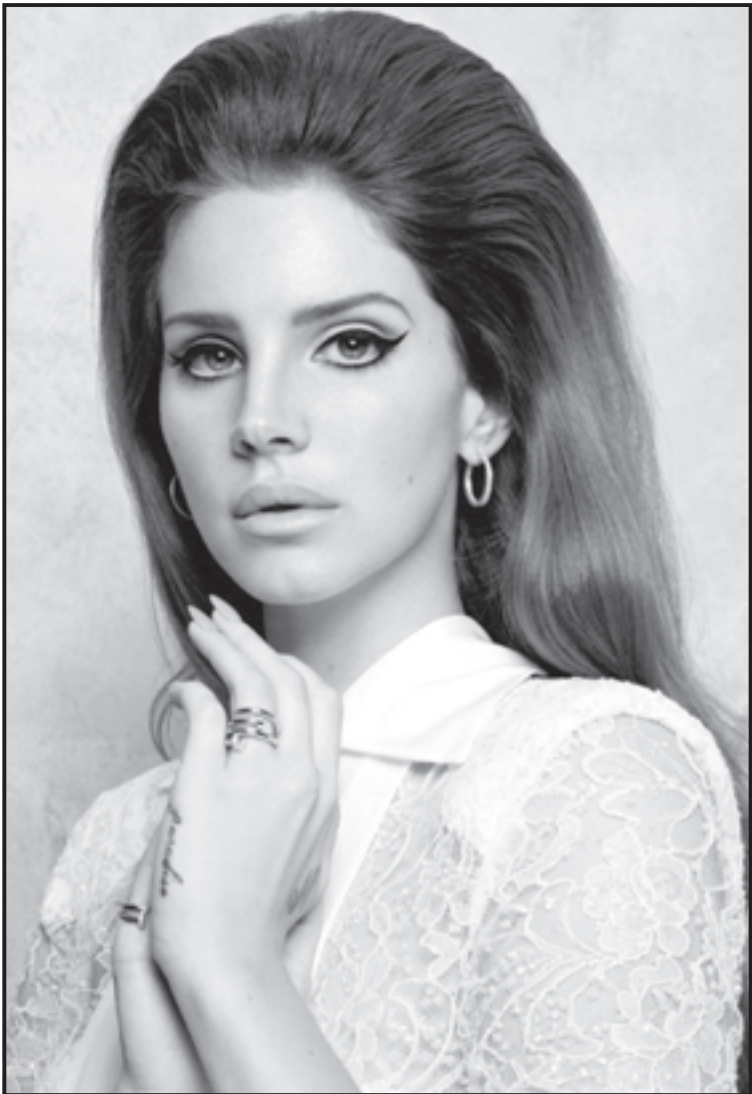
Don't miss popular singer Lana Del Rey at the House of Blues in May! Check MUSIC section for more details.