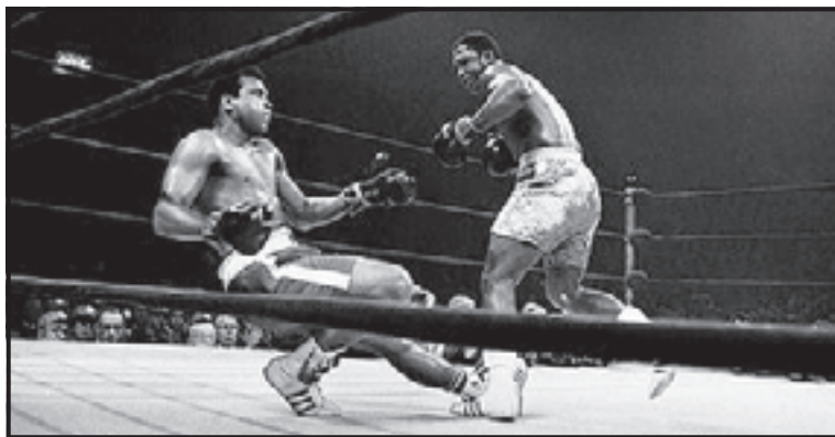
Ali on the way down.

Well, the fact Joe Frazier won the first fight does not fit in with the Ali narrative that has been cultivated in the press all these years. While he is so often portrayed as a martyr, and I certainly agree that stripping him of his title was unconscionable, he was loved by a press that had become increasingly liberal. While touting him as someone who stood up to the establishment, Ali had actually become a part of that establishment. The limousine set loved to praise him and speak of how abused he was by the "man." Ali never had anywhere near the struggles Frazier had growing up. If the Joe Frazier saga had ended with him escaping the poverty of Beaufort, SC and getting a job in a slaughterhouse in Philadelphia, his would have been a great success story. Achieving what he did in the face of all the hatred that was spewed upon him by a