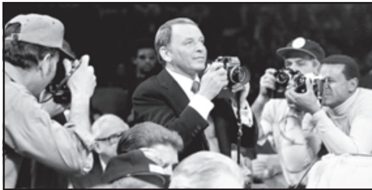
Sinatra snaps photos for Life.