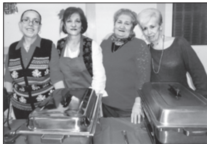
Once again, folks lined up for a great meal as the evening began. There were plenty of seconds to be had and no one left hungry.

Over 70 celebrants showed up at Our Lady of Mt. Carmel's parish center to celebrate Carnevale which is the Italian version of the Marti Gras welcoming in the season of Lent. The event took place on Saturday, February 18. There was a traditional pre-Lenten dinner followed by several hours of great dancing music. A great time was had by one and all. Many party goers wore masks and costumes. Traditional Carnevale desserts were also offered following the meal.