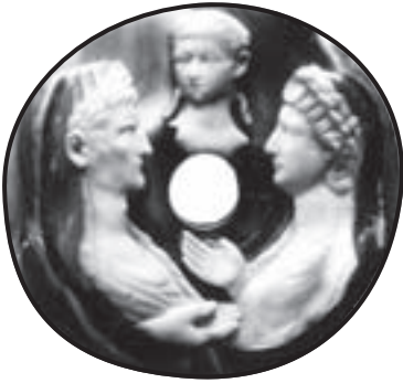
Cameo showing Nero flanked by Augustus and Livia; Hermitage, St. Petersburg

Both Julius Caesar and Augustus Caesar left such an indelible mark on the history of the world up to that time that the Senate conferred the title of Caesar on many succeeding emperors. This is the part of imperial history that is confusing to so many of us today. Some emperors were voted the title of Caesar by the Senate and some were not, while still others did not remain in office long enough to be evaluated. Some of them were gentle, kind, and very considerate, while many