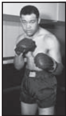
Champion Joe Louis

Jack Dempsey crashed on the scene in 1919 with a spectacular kayo win over the giant Jess Willard to win the title. Jack almost immediately gained mythical status when the film of this fight was distributed and people saw the brutality he