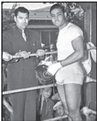
Jack Dempsey and Joe Louis

I know this matchup is no longer the hot topic it once was, but thinking about what would have happened had Joe and Jack met up on their best nights should really excite the imagination.