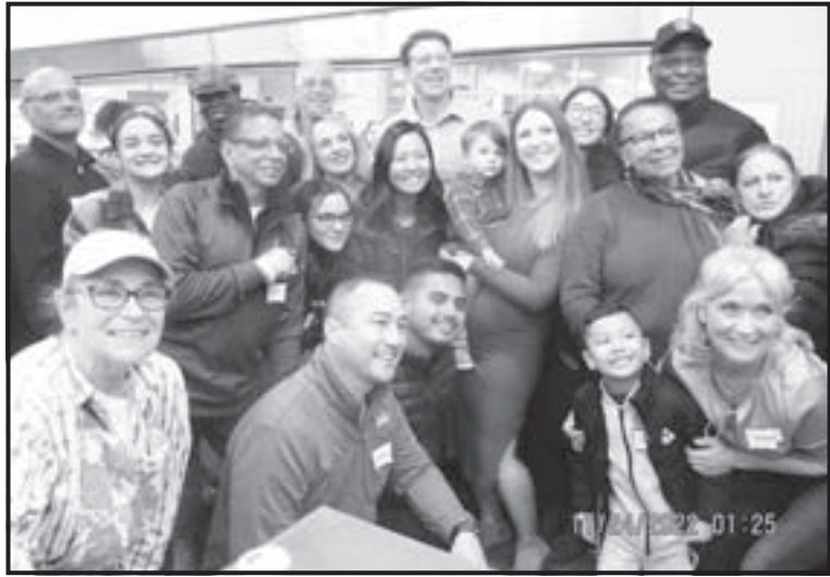
Volunteers were plentiful at the community dinner effort