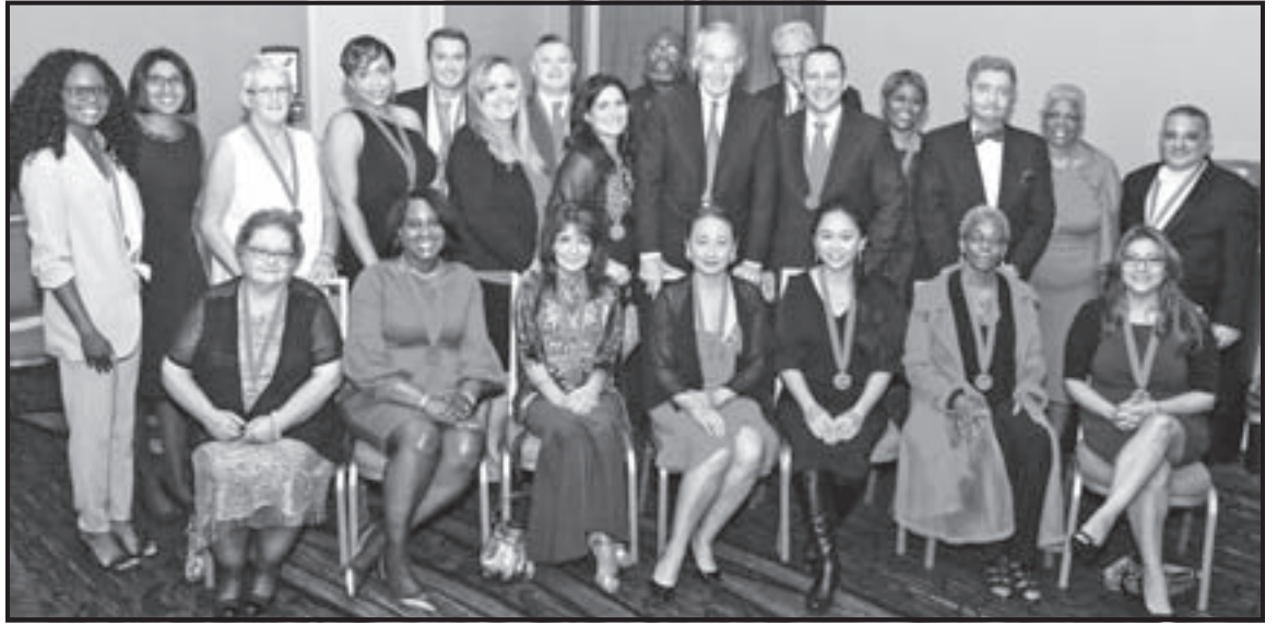
IN IT TOGETHER — The 2018 ABCD Community Heroes Celebration at the Boston Copley Marriott Place Hotel on Friday, October 26, 2018