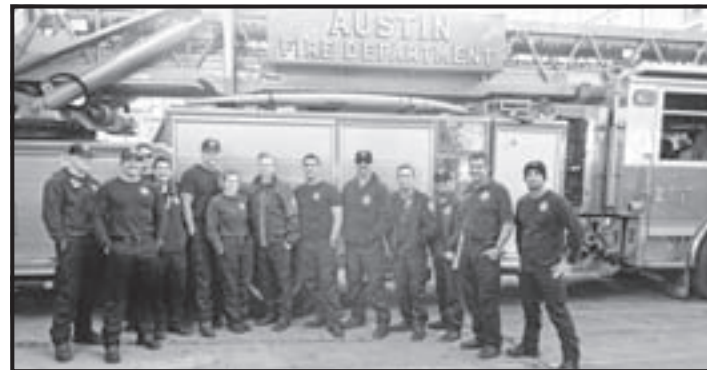
Members of Lucky Engine 13, Engine 1 and Quint 1 at the Central Firehouse in Austin, TX at the corner of Trinity and East 5 th Streets send their Christmas greetings to the Hanover Street Firehouse (Engine 8, Ladder 1) once again.

Back in the '80s and '90s, Actor Tom Berenger was a great action hero. I hadn't seen him for a long time but recently