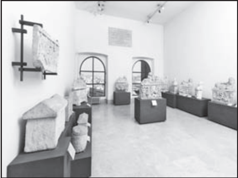
Hellenistic Age Urns in Rooms X at the Vatican Museums

“Funus” is the Latin name for rope, cable, or cord. It is also the name that was given to the funeral rites in ancient Rome. Their Latin word funus, and in turn, our English word funeral, are both derived from the burial procession during those ancient times which employed twisted ropes that had been smeared with pitch and used as torches to light the way. Torches were necessary because all Roman funerals took place during the hours of darkness.