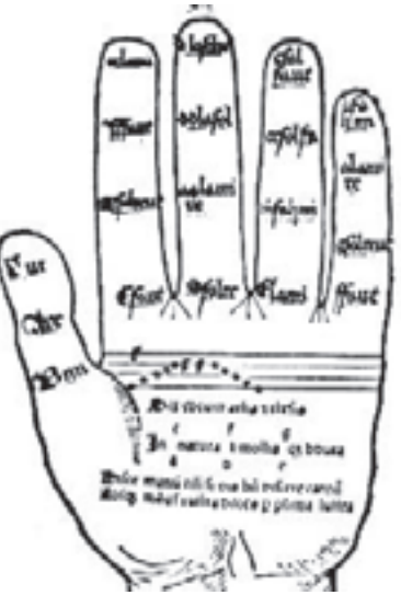
The Guidonian Hand

French singers continue to use it. He also devised a method to teach others the musical notes by writing on his hand at different locations on the fingers; each finger designated a different note to aid in understanding the musical notes. This method was to become known as The GUIDONIAN HAND . By this method Guido was able to teach the singers the notes. This method of teaching notes led to Guido demonstrating it to Pope John XIX.