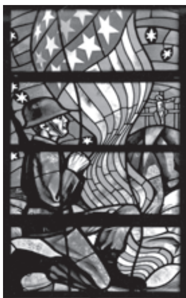
The stained glass window of an American soldier on bended knee is found on the Paris Street side of Sacred Heart Church in East Boston.

I can also remember two other combat veterans. One was a good friend of my father's who walked with a limp which resulted from an injury he suffered during the Attack on Pearl Harbor. He forever remembered December 7, 1941 and considered himself very lucky to have survived