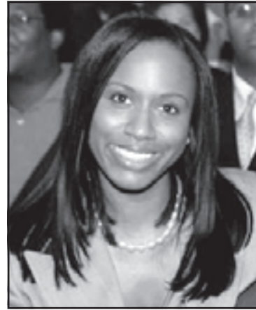
Boston City Councilor-at-Large Ayanna Pressley

What to make of the November 8 results is that