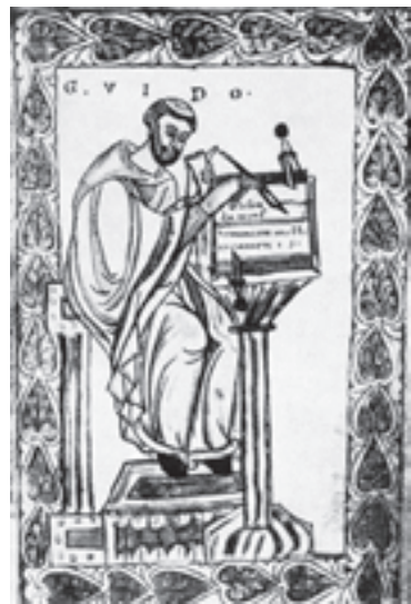
Guido Arezzo a Benedictine Monk.

of syllables to denote the tones of a musical scale or sol fa syllables do, re, mi, fa, sol, la , used in singing the scale of notes. These syllables became the names for the six tones C, D, E, F, G, and A, the hexachord. From a hymn to St. John the Baptist Guido "derived the six syllables ut, re, mi, fa, sol, and la from the first syllables of each of the first six phrases of the text."