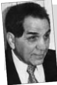
"The Champ" Tony DeMarco