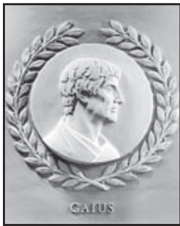
Bas-relief of Gaius from the chamber of the U.S. House of Representatives.

The first book covered laws governing the Roman family, while the second and third treated property rights and the last concentrated on legal procedure. It should be of interest to note that this set became a favorite handbook of law during those ancient times, and was used as a foundation for some