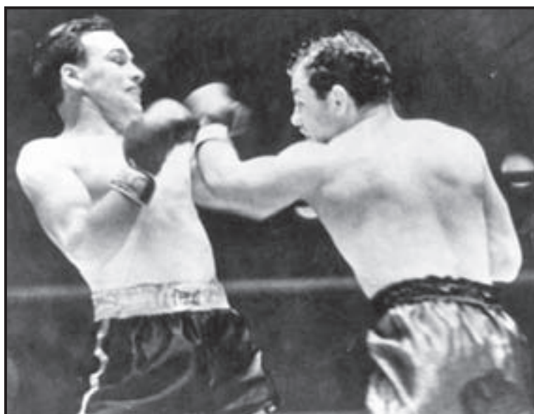
Tony lands a left hook on Jimmy McLarnin

You had opponents of Canzoneri such as Kid Chocolate who was only stopped twice in 152 fights; Jimmy McLarnin lost only one fight by KO out of 69.