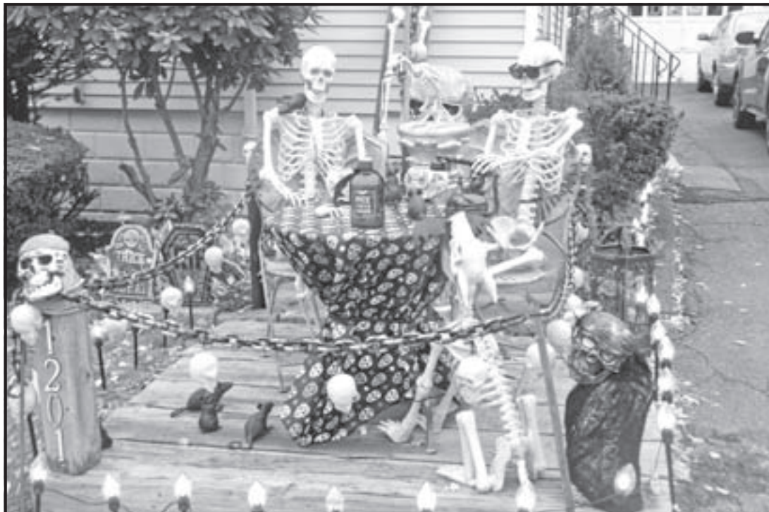
"Honey, have you seen the waiter, I feel like we've been sitting here forever."