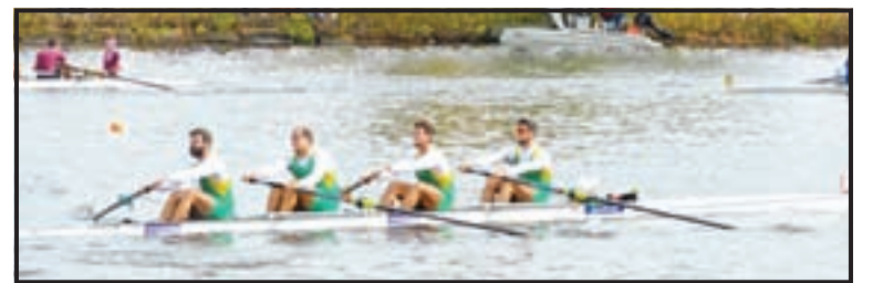
Team Fiamme Gialle