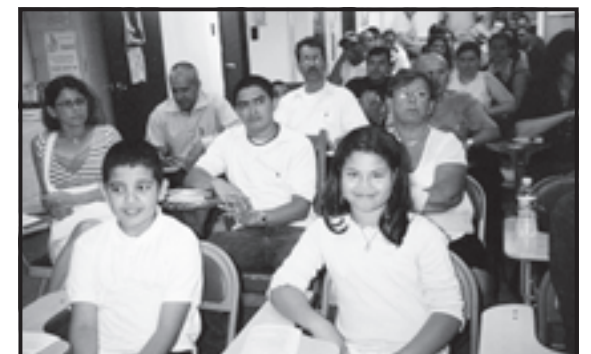
Some of the summer (2008) graduation students.

These are but a few of the over 300 youths and adults the Center has assisted. Dominic Avellani and his professional staff will gladly assist anyone through a good education and training. The Center is located at 119 London Street, East Boston, MA (next to the Sumner Tunnel) or call 617-567-7873.