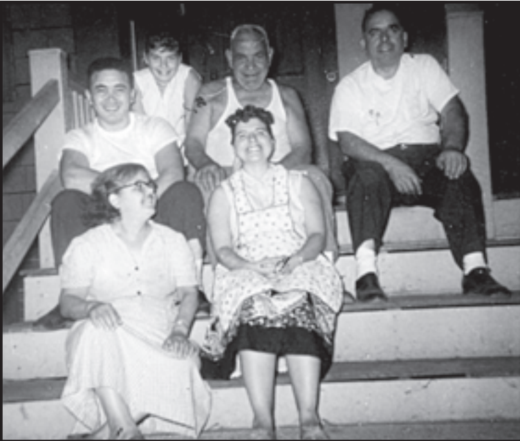
Here in this photo taken in August 1957 are some members of the Giarratani family gathered on the steps of 31 Mt. Pleasant Street in East Somerville.