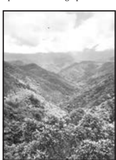
From the veranda

many Colombian towns, Salento wears its history proudly and celebrates the nation's liberator with a Plaza Bolivar. Throughout my stay in Colombia, I saw more monuments to Simon Bolivar than I often do to George Washington in the States but reverence for Bolivar is not the only parallel between Salento and other Colombian municipalities. A church, in Salento's case Nuestra Señora del Carmen, acts as the hub of the town square. But Salento is unique in at least one glaring way. At the end of Calle Real, a vibrant narrow road thriving with shops, are 250 steps carved upon a hill leading up to Alto de