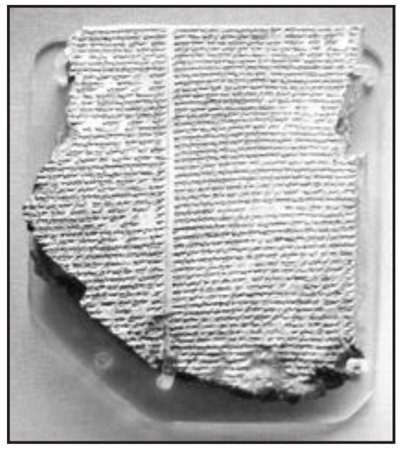
A Clay Tablet

Mesopotamia is the name given to the earliest civilization of Western Asia. It was an area of fertile plains between the Tigris and Euphrates Rivers. The name Mesopotamia is derived from "mesos" meaning middle and "potamos" meaning river, the Greek name for middle river or the area between two rivers. History marks this as the location of the Garden of Eden, Noah's Ark, the great walled city of Babylon with its Hanging Gardens and the Tower of Babel. It is the area, which is now occupied by the country of Iraq. Many of the