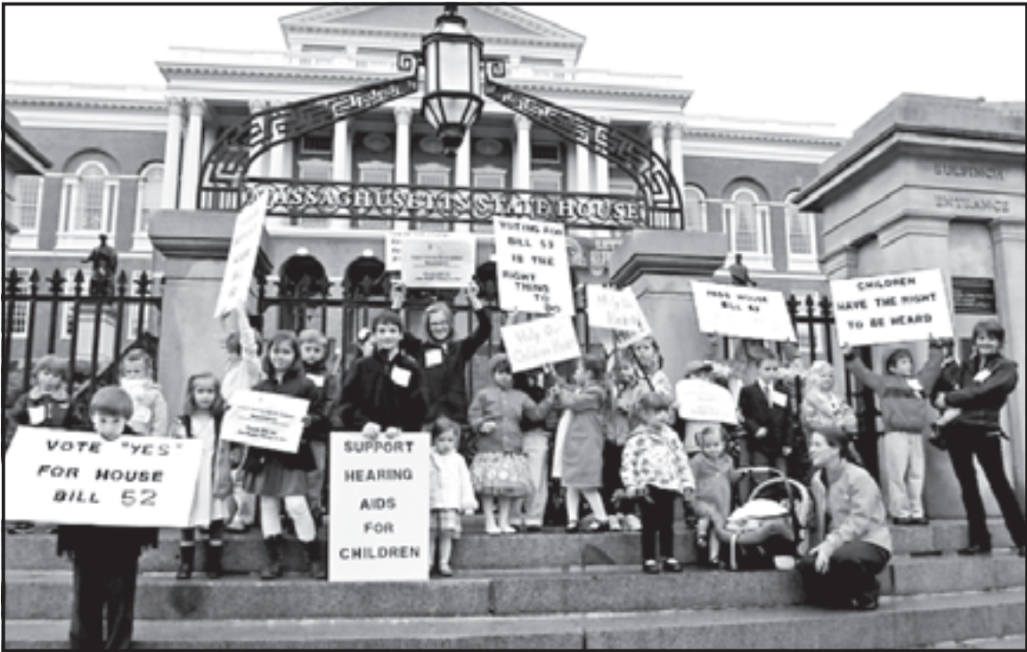
MassHAFCC children on State House steps (Rally)

“An Act to Provide Access to Hearing Aids for Children”