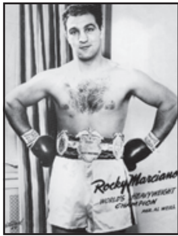
World Heavyweight Champion great Rocky Marciano, to be honored in Brockton June 13-14.