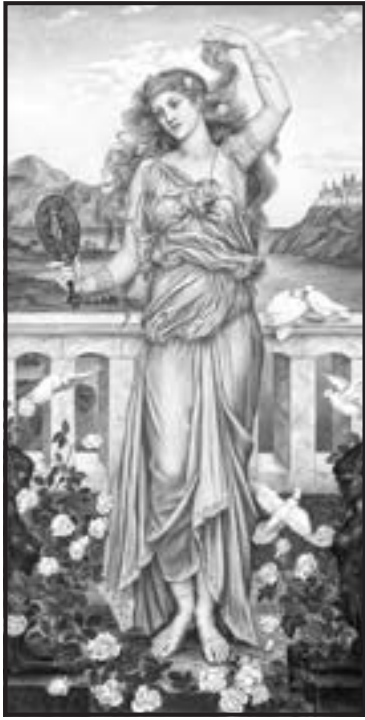
Evelyn De Morgan, 1898, Oil on Canvas, Wightwick Manor, Wolverhampton, West Midlands, England

Two of the earliest men of fame in ancient Greece were poets named Homer and Hesiod. The Romans called them Homerus and Hesiodus. Homer was born sometime between 1200 and 850 B.C. There are at least seven ancient cities that have claimed him. Most accounts of his life say that he was blind, poor, inspired to poetry by the gods, earned his living by singing in a kind of traveling circuit, and lived to a ripe old age. The most popular of Homer's works are, of course, the "Iliad" and the "Odyssey." The Iliad tells of the war waged by the Greeks to rescue the beautiful Helen who was captured and held in the walled City of Troy. The Odyssey tells of the wanderings of Odysseus (Ulysses) after the destruction of Troy, and the return of the lady Helen to her husband in Greece. Homer's portraits of these characters and of the mythical gods are so vivid that they became fixed mental images for all of those persons who, during later centuries, represented them in sculpture, poetry, or painting.