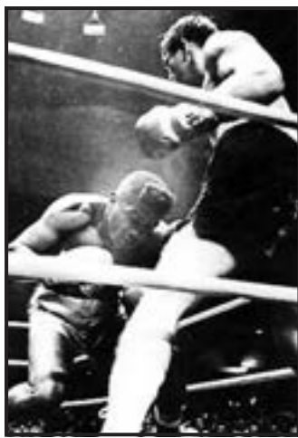
Jerry Quarry dropping Floyd Patterson in their WBA Tournament Fight

I certainly am not trying to justify the taking of the title from Ali, but rather I am just reflecting back on what came from all of what went on back then.