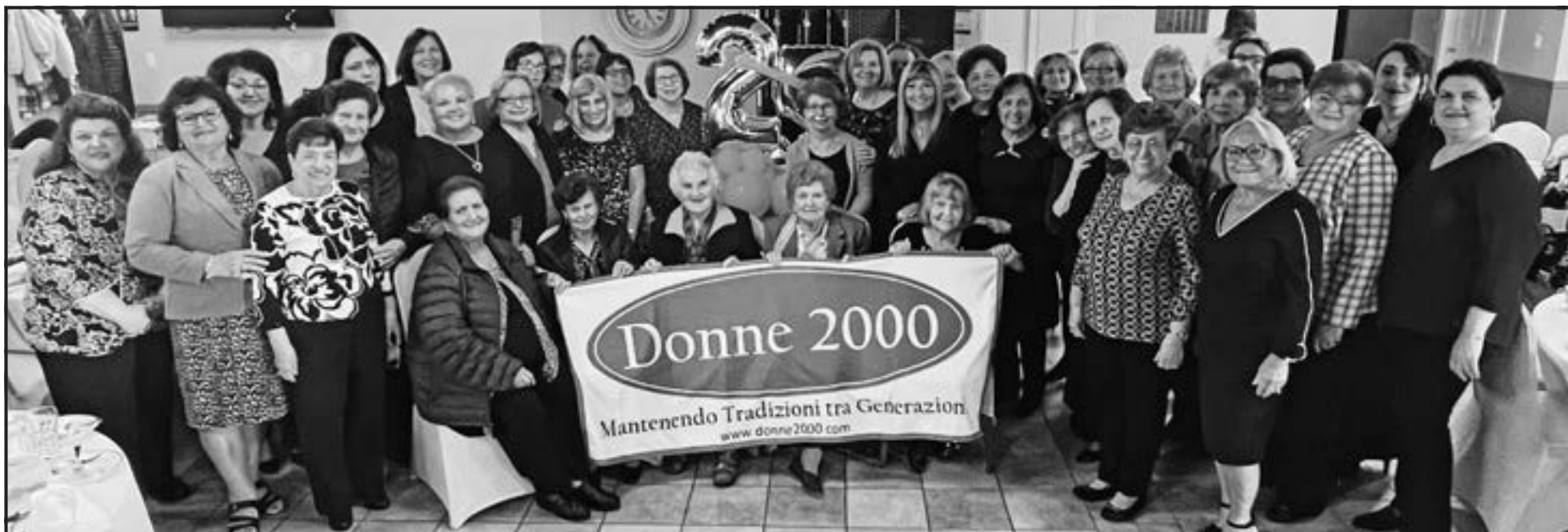
Donne 2000 Members