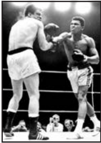
Muhammad Ali lands a right on Karl Mildenerger

Another thing happened during this time. The WBA (World Boxing Association) held a tournament to find a successor to Ali. Joe Frazier refused to take part, but the other leading contenders did. They were Jimmy Ellis, Floyd Patterson, Thad Spencer, Leotis Martin, Ernie Terrell, Oscar