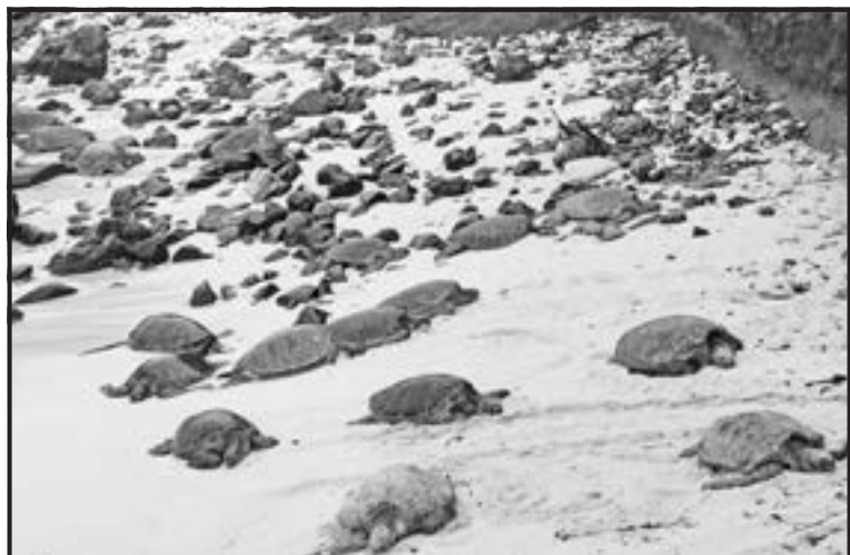
Green Sea turtle

It may not have been the most majestic sight I saw in Hawaii or the most picturesque, but the perseverance and unflinching courage of the green sea turtles flapping their flippers on the shore of Ho'okipa Beach to lay their eggs is surely among the greatest testaments to the resiliency of life in Maui. The turtles don't even make it look easy. They lay on the sand protecting their soon to be hatchlings, patiently awaiting the day the new generation of green sea turtles will accompany them back into the ocean. Before that day comes the parents put on a truly inspiring show of making their way back. Revolving their flippers they waded the rocky sand, slowly inching their way