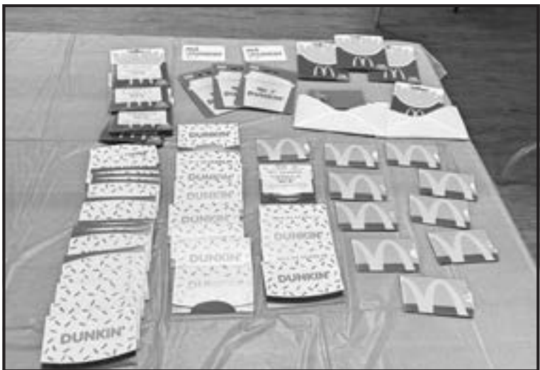
The Amazing Spread of Donated Gift Cards