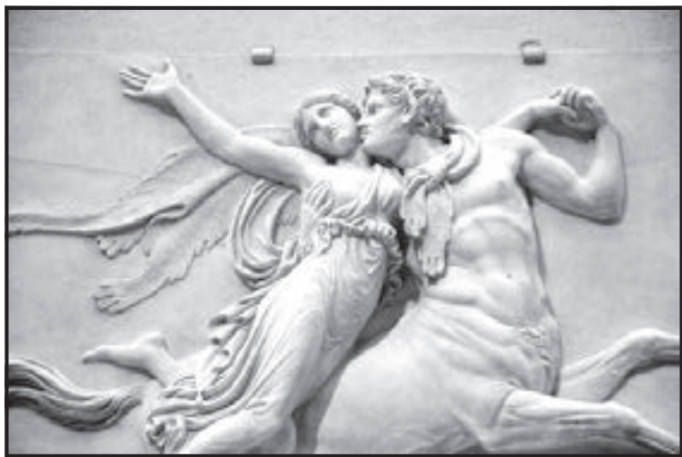
Nessus Abducting Deianira by Bertel Thorvaldsen, 1814 CE. The centaur Nessus tries to abduct Deianira, Hercules' wife, only to be slain by Hercules' poison arrow.

Recently it was stated that Hercules is claimed to be one of the most ancient and most famous of all mythological heroes, and his legendary accomplishments are said to have been the richest and most comprehensive of all myths. It was only fitting then, for the great storywriters of antiquity, to provide that the demise of such a hero be accomplished in a manner, which could only serve to glorify his memory.