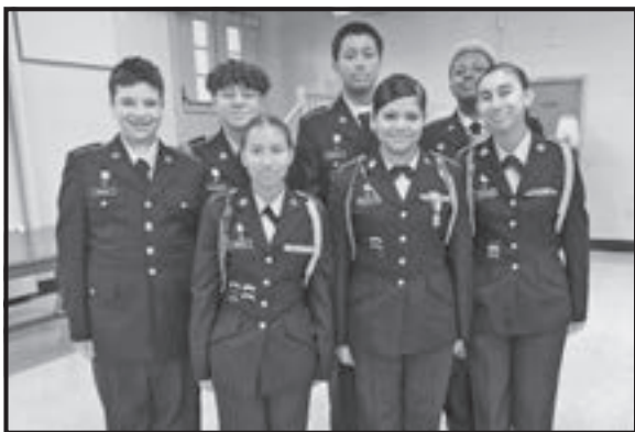
East Boston High School ROTC students served as volunteer assistants during the April 17, 2026 Italian Heritage Parade fundraiser.