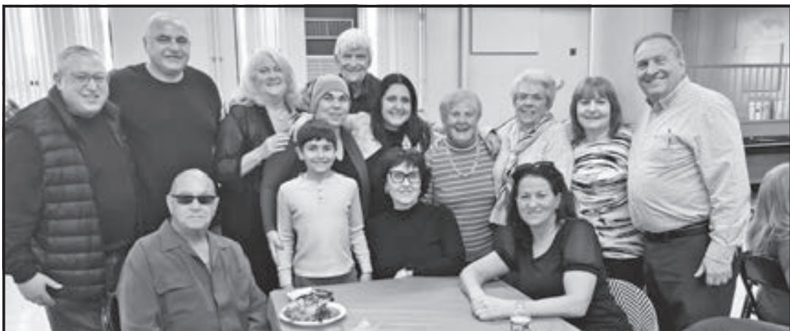
Multi-generations of East Boston families and friends proudly support the upcoming October 11, 2026 Italian Heritage Parade during its first fundraiser, a pasta dinner, held on Friday, April 17.