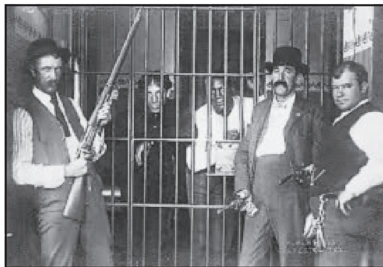
Choynski and Johnson in jail

In Jack Johnson the new boxing was starting to really show itself among the heavyweights. In Jack's fight with Jim Jeffries Johnson's superior skills are on full display. Jeffries was coming into the ring after a six-year layoff, so that certainly played a major role in his loss. What can be seen is the clash in styles. Jim was rushing and trying to bull his way inside where he could use his grappling techniques on the champion. Jack had perfected the arts of feinting, parrying, and tying up his opponent thereby neutralizing Jim's charges. The times they were a changin'.