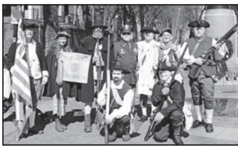
The Wilmington Minutemen gather at the Paul Revere Mall (Prado) on Hanover Street in the North End following the annual Patriots Day Parade.