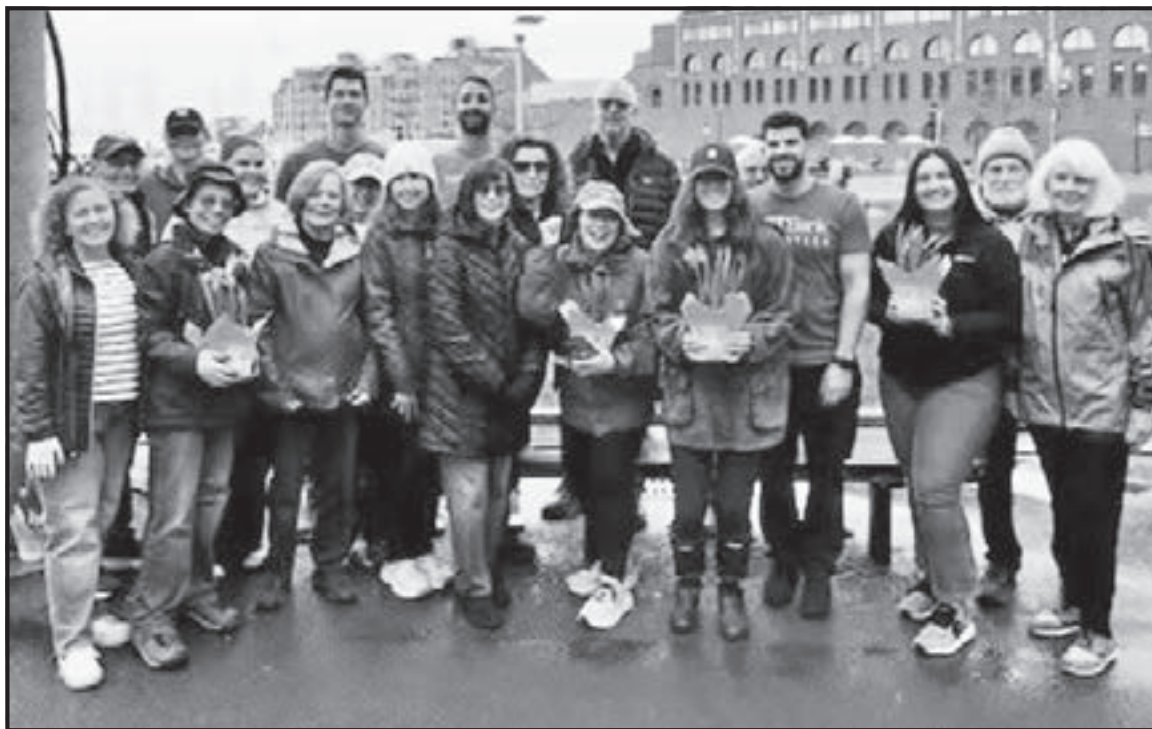
Friends of Christopher Columbus Park Volunteers gather after planting Marathon Daffodils along the Trellis at the waterfront park on Commercial Street.