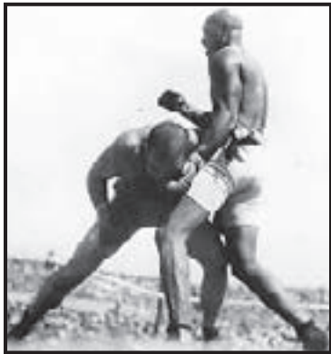
Jim Jeffries rushing Jack Johnson

Light heavyweight Joe Choynski, who kayoed a young Jack Johnson and fought draws with Jeffries, Marvin Hart, and Bob Fitzsimmons. After Johnson and Choynski fought they were immediately arrested for engaging in an illegal sport. They spent 23 days in jail together. During that time Joe taught Jack a number of things about the evolving sport. It marked a turning point in the young Johnson's career.