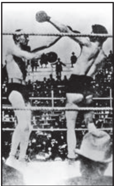
Fitzsimmons (Right) Vs Corbett

Among heavyweights, James J. Corbett became known as the first scientific boxer. He certainly did try new tactics, but he was crude by later standards. Watch footage from his fight with Bob Fitzsimmons and you see how he is attempting to use speed and new types of defensive moves. However, he is off balance a lot and looks terribly awkward. If you were living in that era, you would have most likely been taken with his new and unusual style, at least for a big man.