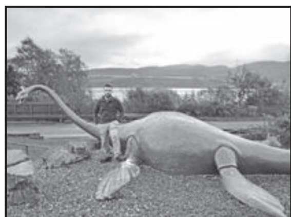
Yours truly and the creature that has stirred imagination for decades

Loch Ness has also become synonymous with national identity and folklore. Its beauty alone should justify its fame but, for over a century, it has been the home of the legendary Loch Ness monster known by the locals as Nessie. Official reports of a large sea serpent inhabiting the lake date back to the late 19th century (earlier medieval accounts are more likely Scotland's answer to the tales of sea monsters popular in the day than any record of a particular sighting), but the legend did not gain popularity until 1934 when, following a handful of alleged sightings the previous year, The Daily Mail published a photograph by London gynecologist Robert Wilson showing what as purported to be a giant creature with a long neck protruding from the waves. A flurry of alleged sightings came in but for decades this photo was presented as the most positive proof of the creature's existence. It would be followed by additional photos of "humps" emerging from the water in the '50s and '60s as well as sonar readings.