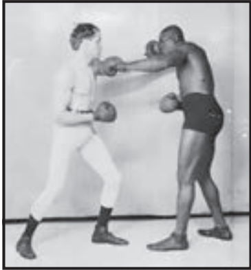
Joe Choynski giving Jack Johnson some pointers

James J. Jeffries, a man considered by many of the old-time historians as one of the top two greatest heavyweight champions, was very strong, but also slow. A lot of his training involved using techniques from the bare knuckle days when grappling was a big part of the sport. In that era, he most likely would have become champion, though in his two bouts with an aging Jim Corbett, he had a tough time with the movement displayed from the former camp. He did eventually catch up to him, but it wasn't easy.