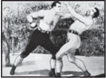
Sullivan Vs Corbett

Most people have thought modern boxing began with the Marquis of Queensbury Rules and the proliferation of the boxing club being used in matches, and the John L. Sullivan vs James J. Corbett fight as the definitive turning point from the crude bare knuckle days to the advent of the scientific period.