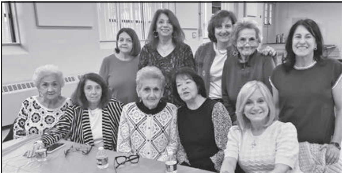
Current and long-time East Bostonians gather to celebrate the revitalization of the 2026 Italian Heritage Parade, at last week's pasta dinner fundraiser in Sacred Heart Church Hall, Paris Street, East Boston.