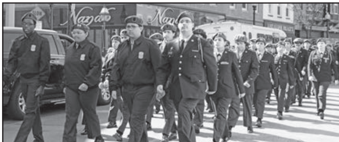
The East Boston High School Color Guard and JROTC walk proudly in the annual City of Boston Patriot’s Day Parade.

patrol as he headed to Concord. Although he was eventually released, it is believed the horse was never returned.