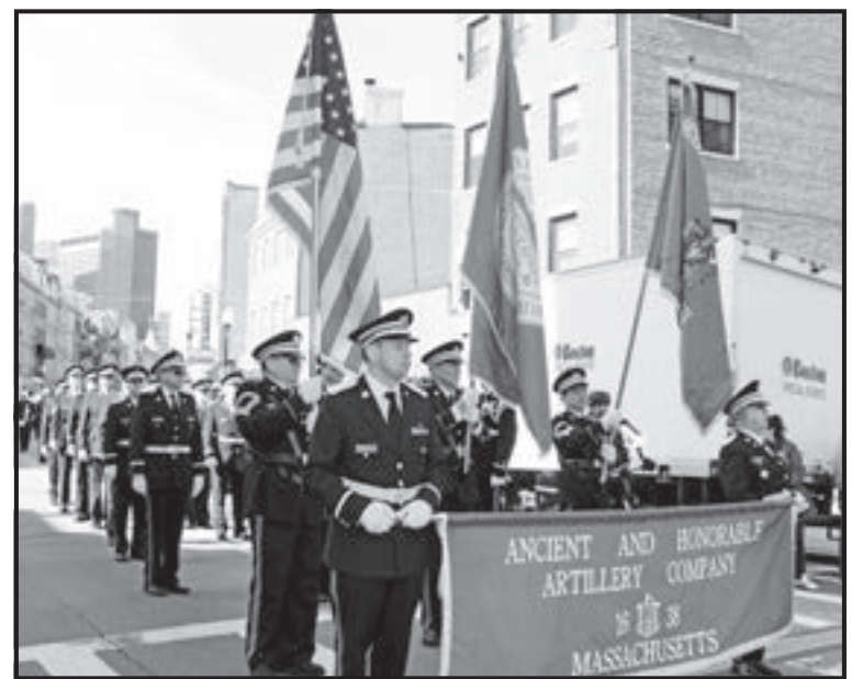
Members of the Ancient and Honorable Artillery Company of Massachusetts lead the annual Patriots Day Parade from Boston City Hall Plaza to the Paul Revere Mall (Prado) on Hanover Street in the North End.