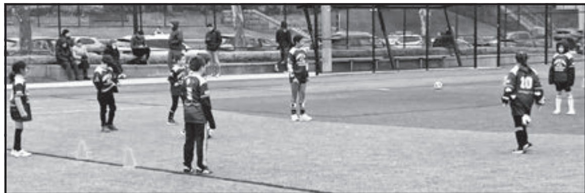
Preparing to defend during an NEAA spring soccer game at Puopolo Park.