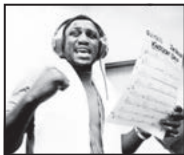
Joe Frazier in a recording session.

On February 15, 1970, Joe Frazier and his band The Knockouts appeared on the Ed Sullivan Show . This was the night before his first fight with Jimmy Ellis. Joe belted out the Wilson Pickett song "Knock on Wood." He looked fit and ready for the fight and gave a decent performance but was not of championship caliber when it came to singing, though he sure did enjoy performing.