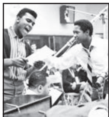
Muhammad Ali and Sam Cooke in the studio.

Muhammad Ali was twice nominated for a Grammy Award. Neither nomination was for his singing talent however. The first was in 1963 when his album I Am the Greatest was chosen in the best comedy album category. The second was on record nominated in the Best Recording for Children category in 1976 called The