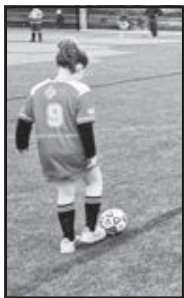
It's all in the foot-work at NEAA spring soccer.