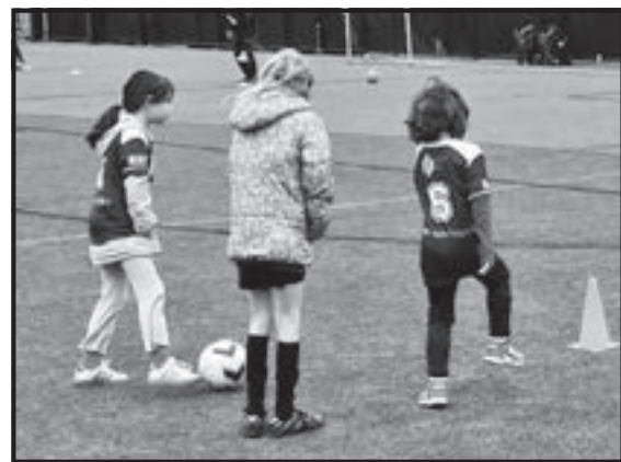
Let's run and keep warm during an NEAA 2026 Inaugural spring soccer game at Puoplo Park.