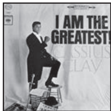
Grammy nominated album.

During his brief reign as heavyweight title holder, Ingemar Johansson showed some real talent for performing on television. In 1959, he appeared on the Dinah Shore Show where he sang two Swedish songs. One solo and the other in a duet with Dinah. It's fun to watch his performance where he comes across with a great sense of humor and a charming performance. He was also quite flirtatious with Dinah who seemed to enjoy his attention.