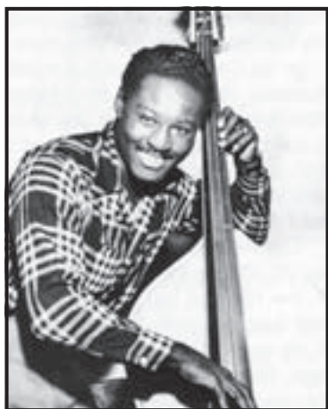
Ezzard Charles on the bass.

Performing music had also been an allure for many pugilists. Most are familiar with the story of Joe Louis and the violin lessons. How his mother signed Joe up for lessons, but after a while he was drawn to the boxing gym. He took the money he was given for the music instructions and used it to pay for schooling in boxing. The rest is history.