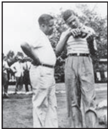
Joe Louis brushing up on the violin.

Music and boxing have always had a close link. There have been many songs written about those who practiced the Sweet Science. Boxers have also been drawn to performing on stage. A number of them have been in movies and on the stage. These include John L. Sullivan, James J. Corbett, Jack Dempsey, Maxie Rosenbloom, and Max Baer.