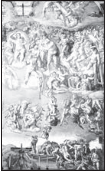
The Last Judgment (Italian: Il Giudizio Universale ), Michelangelo, 1536-1541, Sistine Chapel, Vatican City

Lastly, of course, there was Hades (our Purgatory), in the depths of the earth, with its wide open doors. This was the place where all dead souls went while awaiting judgment and commitment to the upper or lower world. Hades was usually represented as a place and also a person. As a place, it was a grove of barren willows, veiled in darkness or clouds where the sun never shone. The ground was covered with asphodel, a dreary plant of the lily family that was often planted on graves. The entrance to this place called Hades was guarded by a dog named “Cerberus,” a terrible monster with three heads, a tail of three serpents, and a body bristling with vipers.