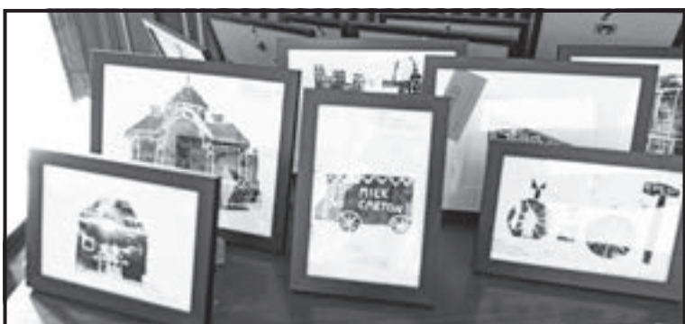
Artwork made by Bradley Students that were auctioned off