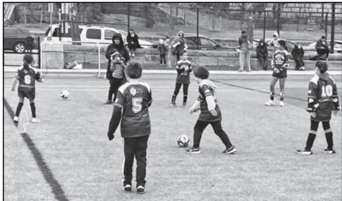
Practice makes perfect during the Inaugural 2026 NEAA spring season soccer program.