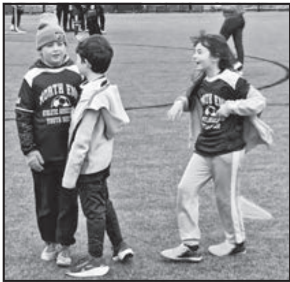
Three happy NEAA 2026 spring season soccer participants.

There will be a 30-minute practice followed by games each Saturday starting at 12:30 p.m. at Puopolo Park on Commercial Street.