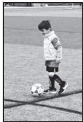
Ready, set, kick and in the net an NEAA spring soccer game.