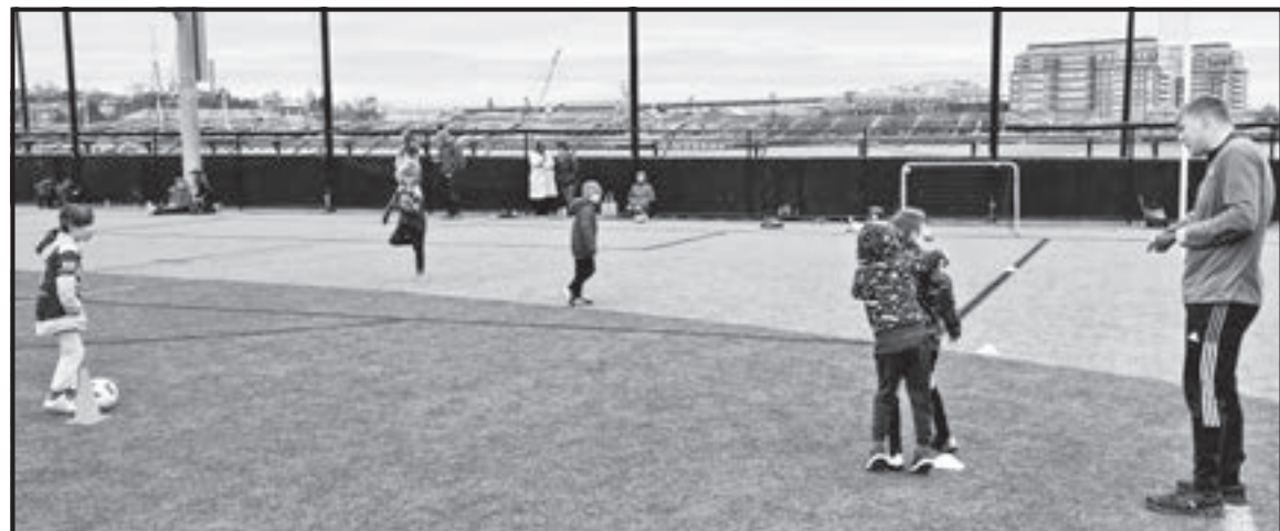
NEAA spring soccer drills and skills at Puoplo Park on Commercial Street in the North End.