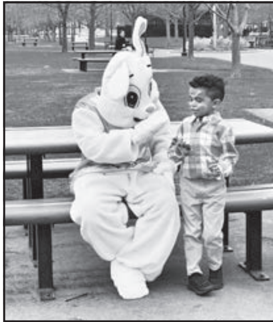
The Easter Bunny and a pal sharing some treats and a high five during the East Boston Easter Egg Hunt.