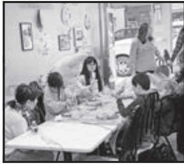
A&L Bakery on Sumner Street in East Boston held an Easter Egg cookie decorating event.

Recently, the Easter Bunny arrived at A&L Bakery in East Boston for cookie decorating and all the kids showed up for all the fun. Over a dozen children made the most of this event decorating and eating up their creations.