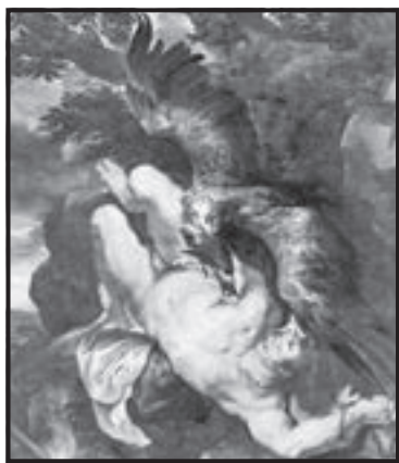
Prometheus Bound by Peter Paul Rubens, Circa 1611 to 1612, Philadelphia Museum of Art

The legend concerning the apples of the Hesperides starts with the marriage of Jupiter, chief of all Roman gods, to the goddess named Juno. The wedding was attended by all other deities, who brought beautiful gifts. The grandmother of the bride brought a wedding gift of golden apples growing on live branches. As soon as the ceremonies had ended, the branches were planted in the sacred garden of Juno. The Hesperides, three daughters of Atlas, and a goddess named Hesperis, were directed to cultivate and watch over the growing trees. The golden fruit soon became known as the apples of the Hesperides. The girls were negligent in their duties and frequently plucked off apples for themselves. Consequently, Juno sent a large serpent to guard the fruit. This monster had a hundred heads that slept at different intervals, so that it was ever watchful. The eleventh task required of Hercules was to bring back to the king, at the city of Tiryns, the apples of the Hesperides.