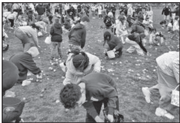
It was an Easter Egg Frenzy at the 10th Annual East Boston Easter Egg Hunt 2026, at Bremen Street Park.

The 10th Annual Eastie Easter Egg Hunt, held this past Saturday, April 4, was once again a phenomenal success.