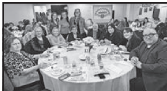
Donne 2000 members and family