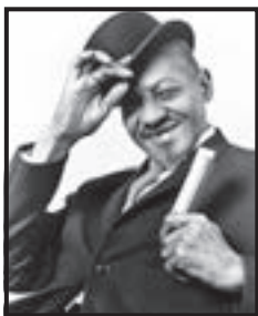
Sonny Boy Williamson