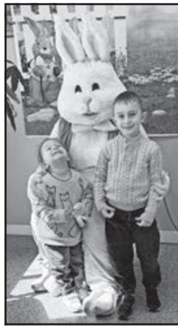
It was nothing but laughs with the A&L Bakery Easter Bunny on Sumner Street in East Boston.

I thought about this place while listening to Sirius Radio one morning while driving to work when the station played