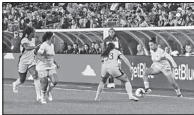
The Boston Legacy hosted the #1 ranked San Diego Wave at Gillette Stadium in front of over 10,000 fans.

In case you hadn't heard, the latest addition to professional sports in Massachusetts are the women of the Boston Legacy FC who had their National Women's Soccer League inaugural match on March 14 th at Gillette Stadium.