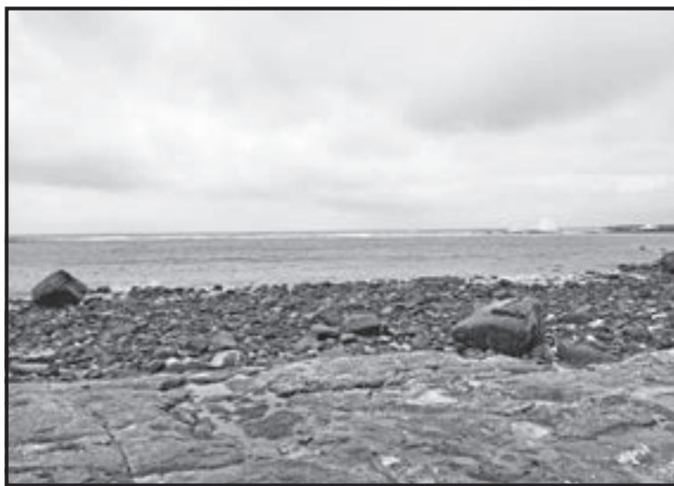
An Corran beach

After a while I stopped looking for the dolphins and simply took in the view. The sea, disappearing into the horizon beyond our vision, is nature's clearest reminder of the expansiveness of our world and, in a sense, a connector of our diverse lands.