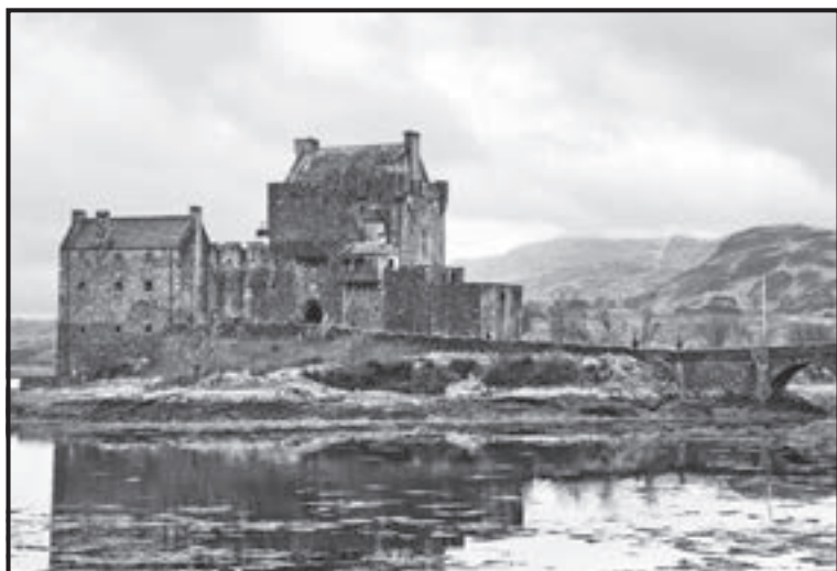
Eilean Donan Castle