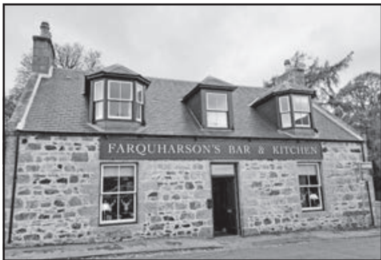
Farquharson's Bar & Kitchen

As a modern structure by castle standards (indeed, the title of castle seems hardly justified to the purpose of what has essentially been a summer home for every crowned