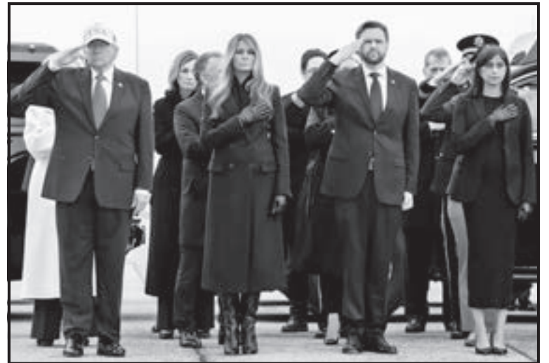
(L-R): President Donald Trump, First Lady Melania Trump, Vice-President JD Vance and Second Lady Usha Vance salute as the dignified transfer takes place at Dover Air Force Base, Delaware.

As part of the protocol, President Trump did not speak