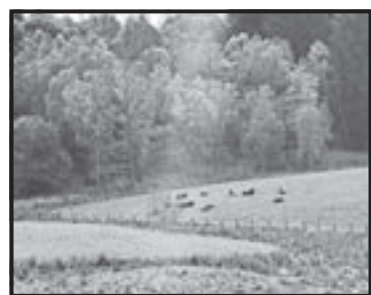
Sheep and highland cows

After a walk through the Tay Forest Park, I drove on the fabled Road to the Isles, a stretch of road that takes you along some of Scotland's most picturesque hills, where sheep and a few highland cows are often your only companions for miles. I did spot a number of the elegant Scottish red deer and the pheasants that escaped the farms, but the general solitude of the land felt more inviting of reflection than foreboding to the spirit.