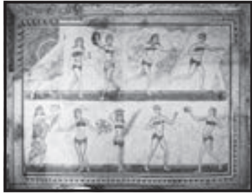
The Bikini Girls in Ancient Italy keeping fit.

Medicine balls were typically made of leather and stuffed with sand, rags, or even horse hair. The ball can be traced back to Ancient Greece. The early versions were made using animal bladders with sand inside. Hippocrates, the father of modern medicine, recommended using it to recover health and build strength; thus the name "medicine ball."