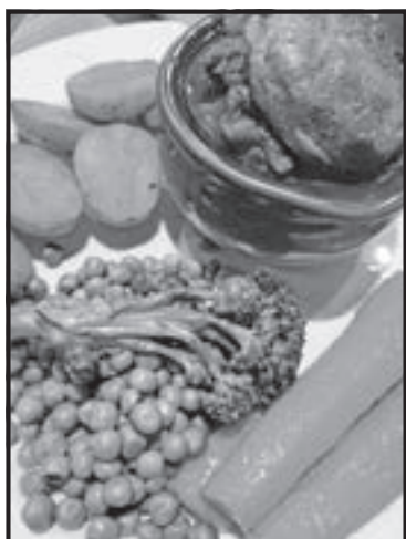
Farquharson's Bar & Kitchen and their stew and potatoes

head since Queen Victoria), the history of Balmoral has a louder pulse than many of the ancient structures I had visited. This was the place, after all, where Queen Elizabeth II had spent her final days just over three years earlier. History, then, continues to be made at Balmoral and the place continues to evolve both structurally and spiritually. In 2024, private rooms were opened to the public for the first time in the estate's history.