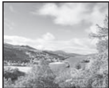
Queen's View with Loch Tummel over Glencoe Mountains

In 2017, while visiting Joshua Tree, a ranger lamented to me the difficulty the park had attracting the casual nature lover as the desert lacks the icons that have become emblematic of national parks such as snow-capped mountains. But the beauty of ecotourism is that no two places are alike. Nature's landscapes are as varied as our world is big and the rewards of nature are in its very biodiversity.