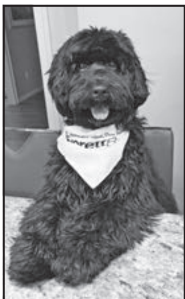
Sawyer Australian Labradoodle

A number of studies published have linked owning a dog to a 32% lower risk of dying from all causes over the course of a decade and a study