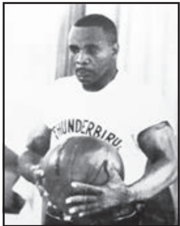
Sonny Liston absorbing punishment.

That was an interesting theory. When I first heard this I asked my boxing trainer about it. He shook his head and replied to me sarcastically, "If hitting the guy in the stomach will make him tougher, why don't they hit him on the jaw with a hammer, that will make him unbeatable." His comment certainly made sense to me. Perhaps when training, fighters should have just taken turns beating each other up. The more punishment absorbed the more durable the boxer becomes.