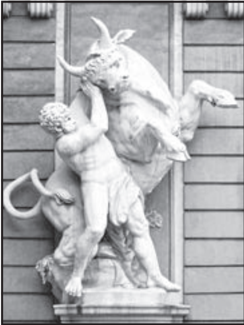
Statue of Hercules and the Cretan Bull by Lorenzo Mattielli, Hofburg Palace, Wien, Vienna, Austria

Continuing our coverage of Hercules and his celebrated labors, we recall, briefly, that this demigod was the offspring of one of Zeus' paramours. Later, in a period of madness brought on by the unrelenting hostility of Zeus' wife, Hercules killed his own wife and children. When he regained his senses, he was horrified at what he had done and sought advice from the Oracle at Delphi. He was advised to go to Tiryns and perform whatever ten labors King Eurystheus would demand of him. We also learned that Hercules would, in fact, perform twelve labors because two of them, the second and fifth, were disqualified.